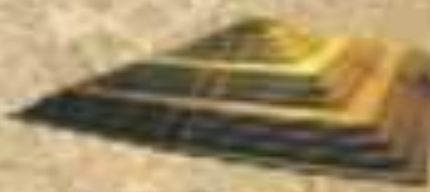
Qin Shi Mausoleum Xi'an, China - 210 BCE