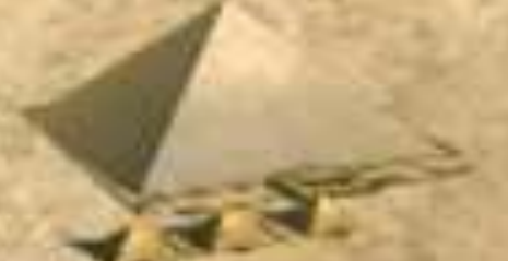
Pyramid of Khufu Cairo, Egypt - 2560 BCE