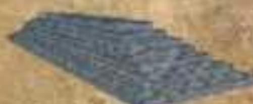
Pyramids of Gümjar Chacoma, Tacaná - 1,100 CE