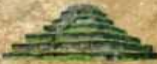
Prang Temple Koh Ker, Cambodia - 900