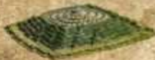
Borobudur Temple Java, Indonesia - 800 CE