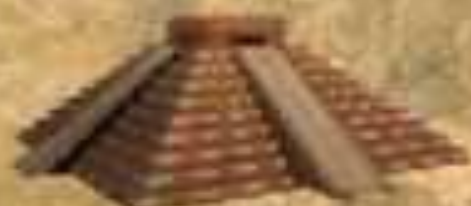
El Castillo Chichen Itza, Mexico - 1000 CE