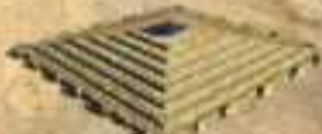
Tomb of the General City of Nan, China - 100 CE