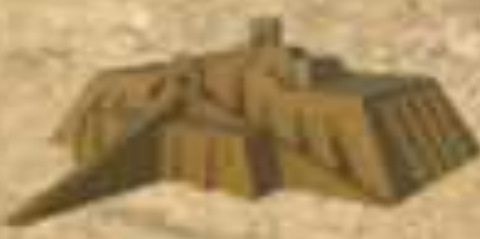
Ziggurat of Ur City of Ur, Iraq - 2000 BCE