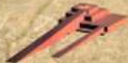
Ziggurat of Tepe Sialk Kishan, Iran - 3000 BCE