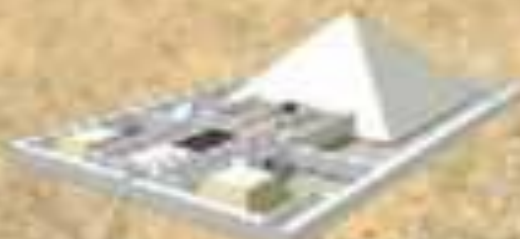
Pyramid of Djoser Memphis, Egypt - 2630 BCE