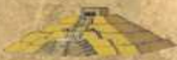
Pyramid of the Sun Teotihuacan, Mexico - 100 CE