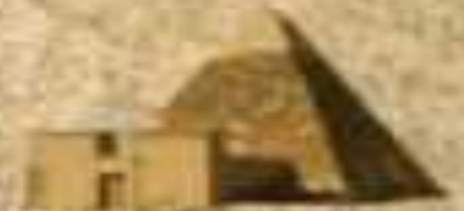
Tomb of King Kashta Merou, Nubia - 700 BCE