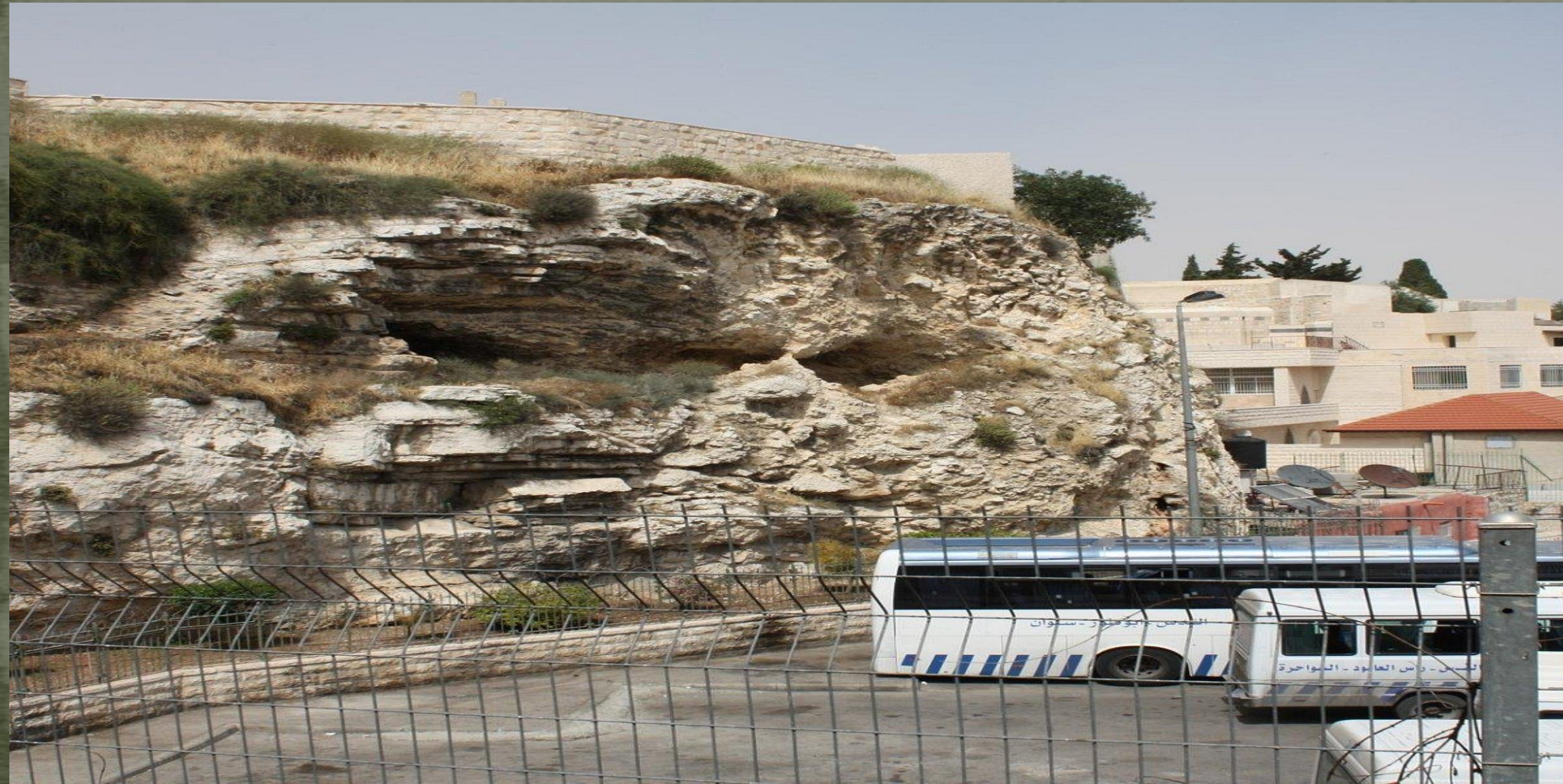
“place of the skull”