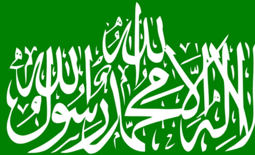
Hamas – Gaza/West Bank Sunni