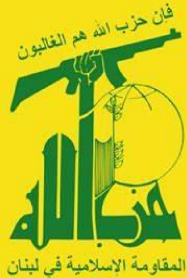
Hezbollah – Lebanon Shia