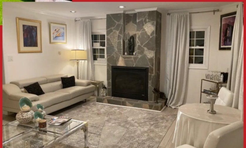
Living Room Space