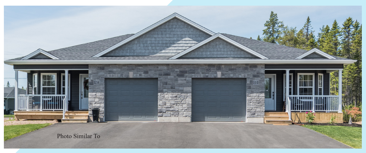
28' x 55' SINGLE CAR GARAGE 1227 SQ FEET $345,900.* WALK-OUT BASEMENT $335,900.* No Walk-Out Basement