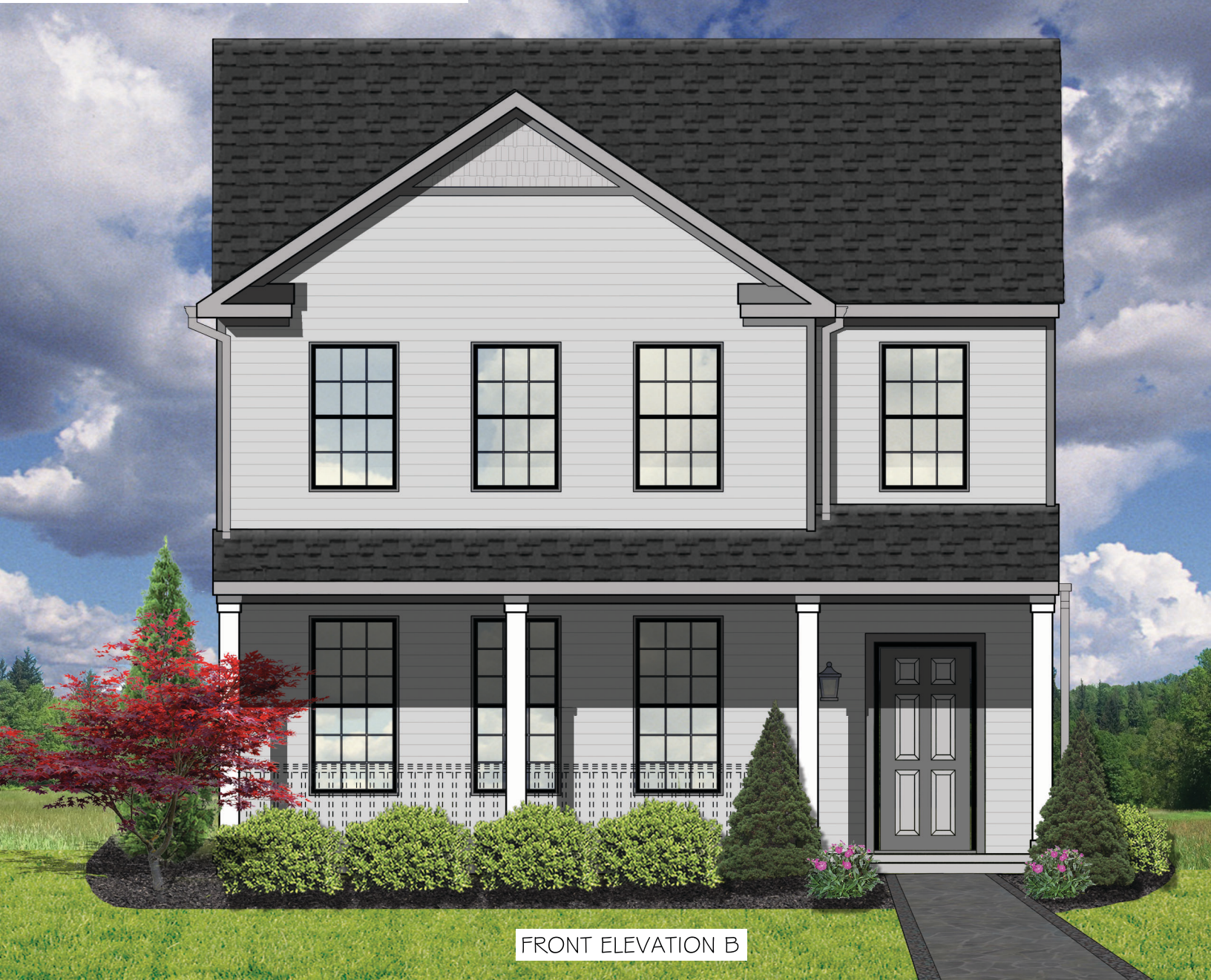
FRONT ELEVATION B