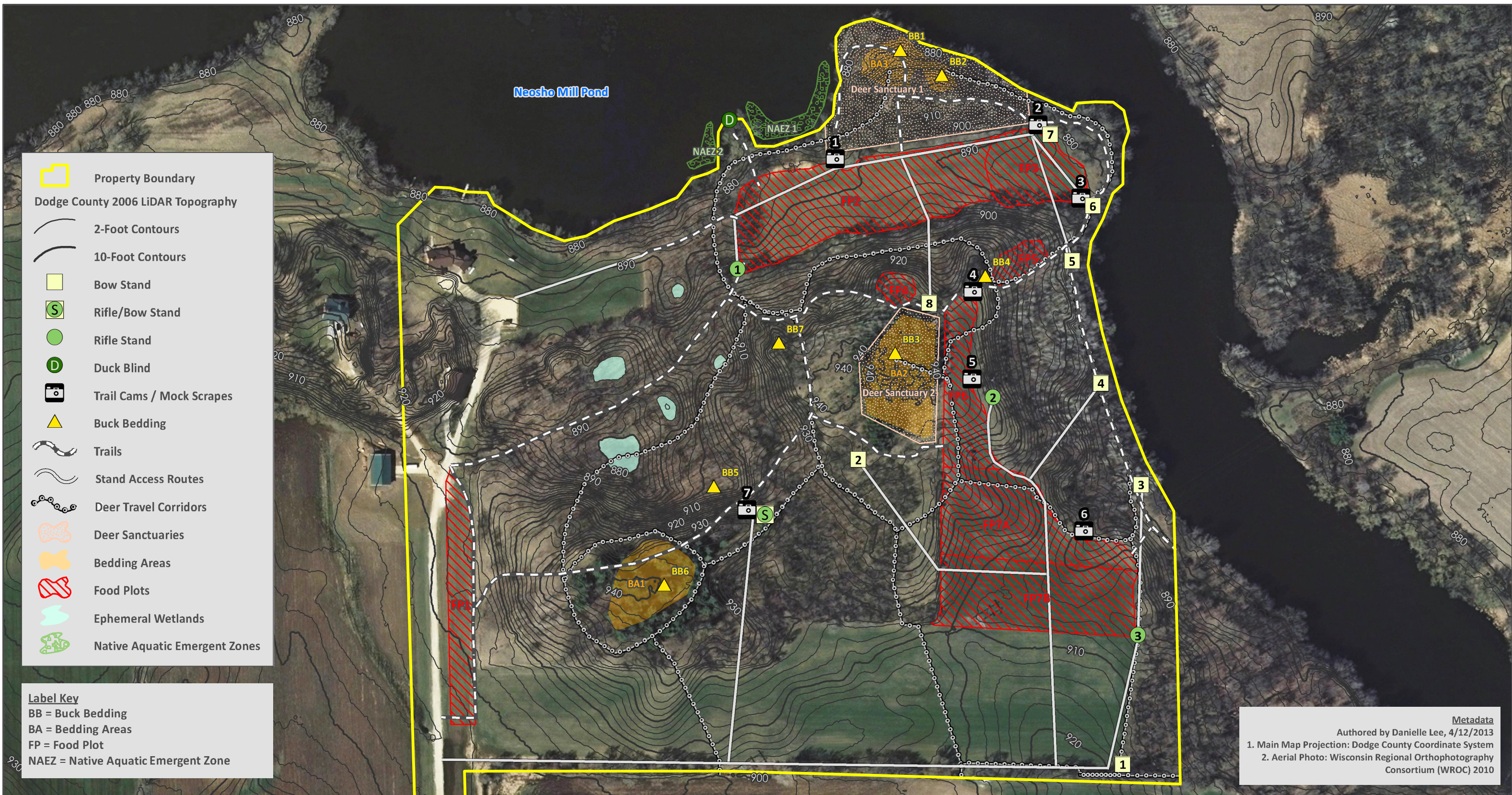
Figure 2 – Kinnamon Whitetail Deer Management Map

W2096 County Rd NN Neosho, WI 53059 T10N R17E Sections 28 and 29 Town of Rubicon | Dodge County, WI