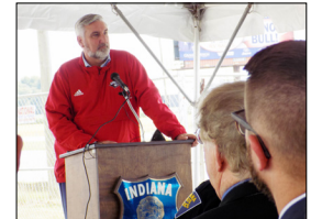
Indiana Gov. Holcomb speaks to groundbreaking attendees in Evansville.

The Evansville location will receive an additional 40,000 s.f. housing a new state-of-the-art forensics lab and become a regional hub impacting the drug unit and increasing forensic laboratory services across the state. The ceremony was held Friday, June 23, at the current Evansville post, 9411 U.S. 41, just south of I-64.