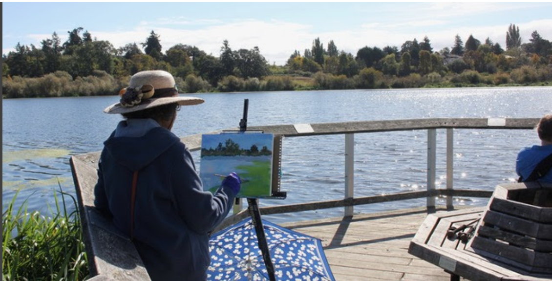
Swan Lake Nature Centre