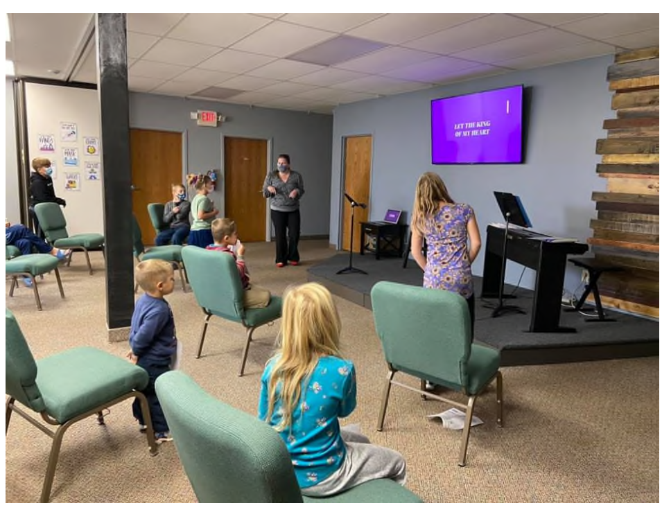
We had 12 kids the first week of Sunday School!

Let the King of my heart be The wind inside my sails The anchor in the waves; oh He is my song Let the King of my heart be The fire inside my veins And the echo of my days; oh He is my song