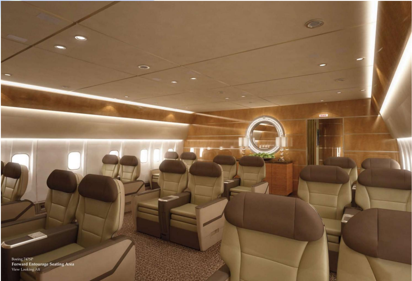
Boeing 747SP Forward Entourage Seating Area View Looking Aft