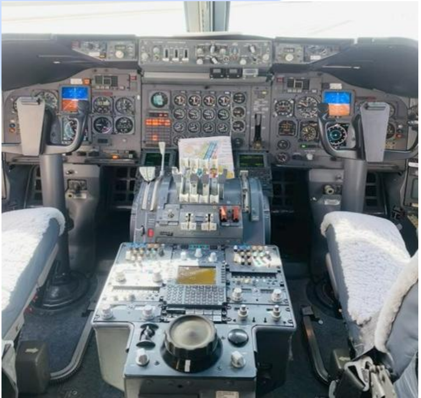
This B747SP is fully outfitted and ready for worldwide service including avionics upgrades for ADS-B and FANS-1/A(CPDLC).