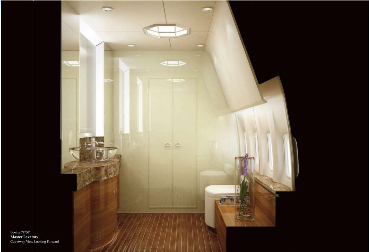
Boeing 747SP Master Lavatory Cut-Away View Looking Forward