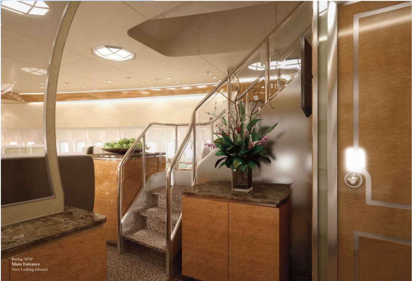
Boeing 747SP Main Entrance View Looking Inboard