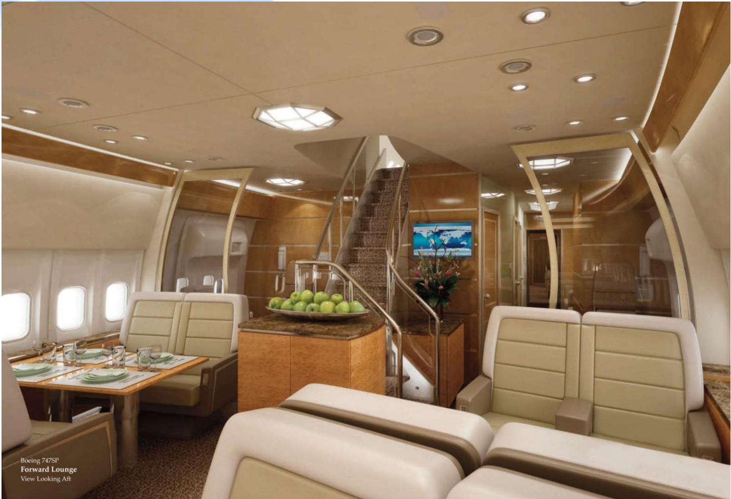
Boeing 747SP Forward Lounge View Looking Aft