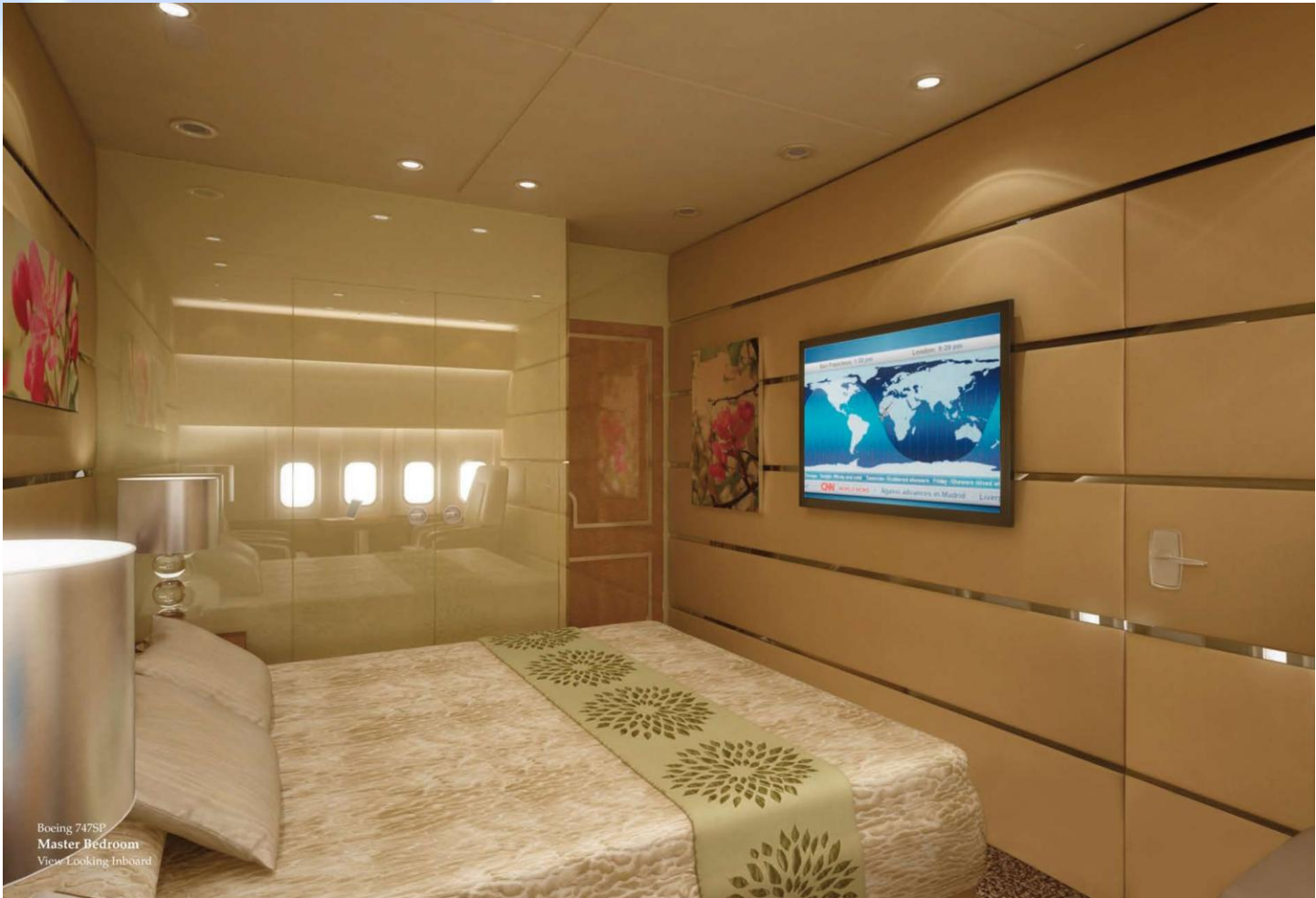
Boeing 747SP Master Bedroom View Looking Inboard