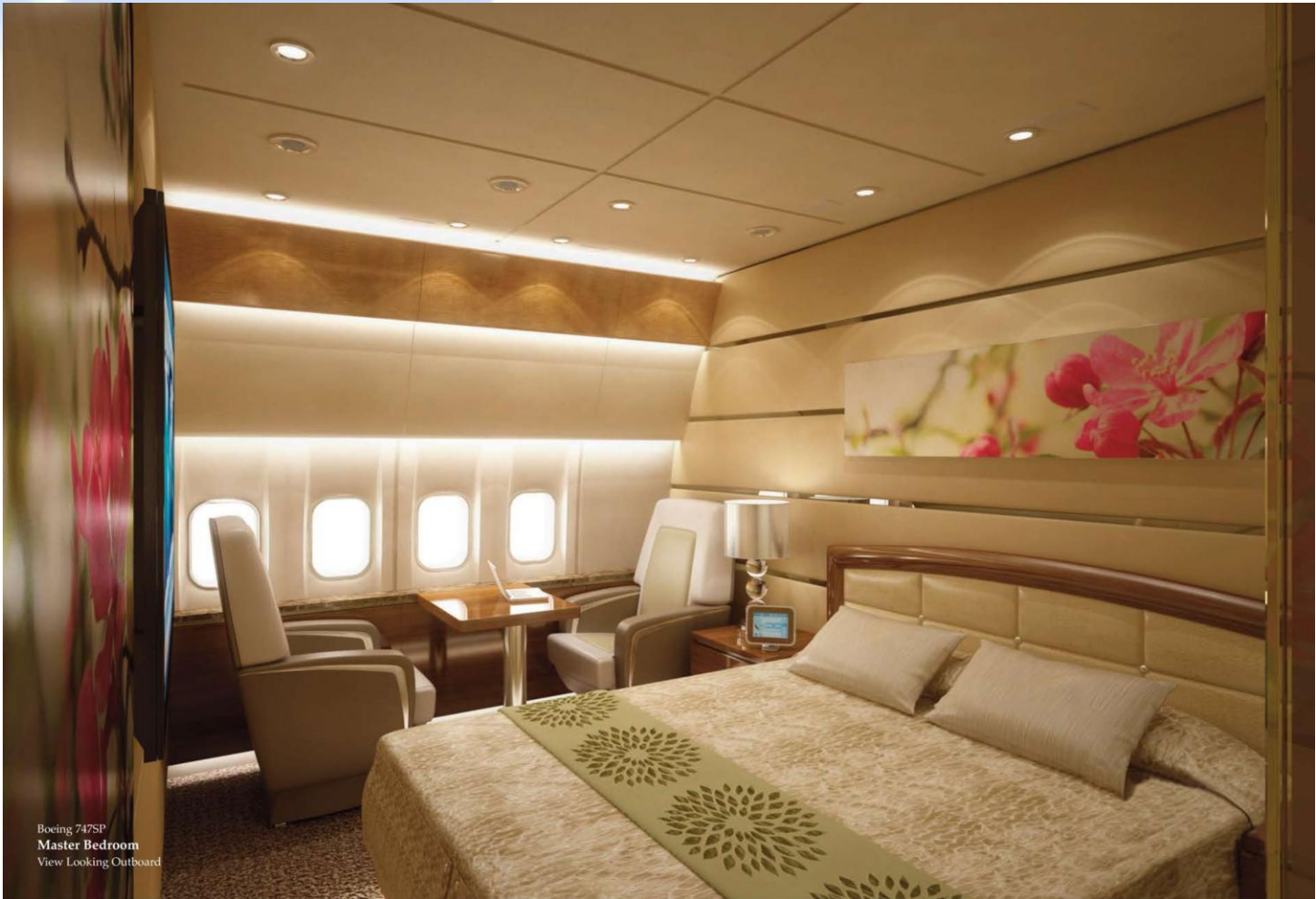
Boeing 747SP Master Bedroom View Looking Outboard