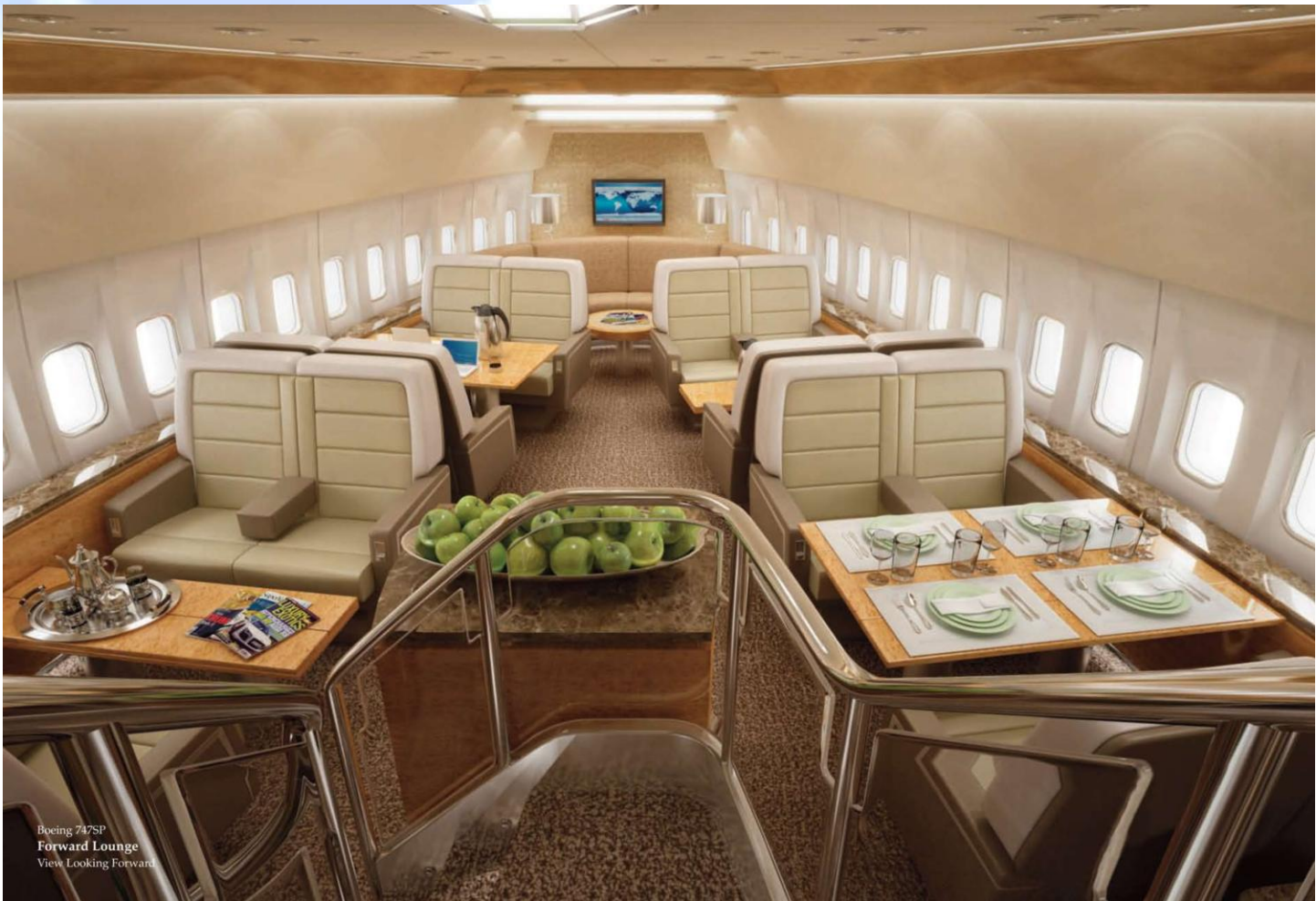
Boeing 747SP Forward Lounge View Looking Forward