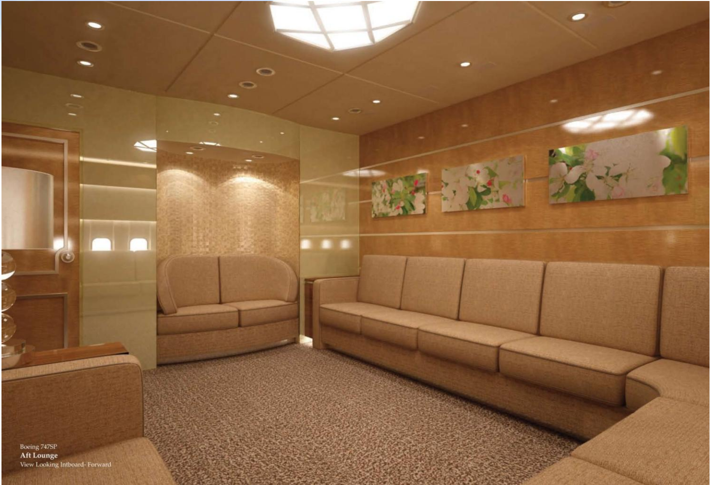
Boeing 747SP Aft Lounge View Looking Inboard-Forward