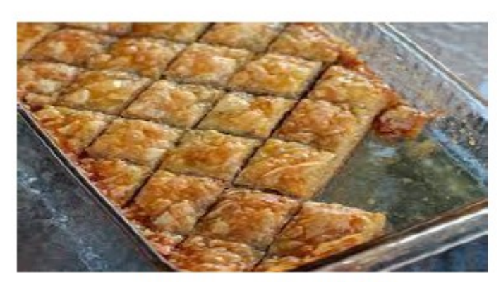
Baklava – Μπακλαβάς $60.00 for 1 Tray - $2.50 each piece

Call Georgia @ (905) 681-2299 by December 12 to order