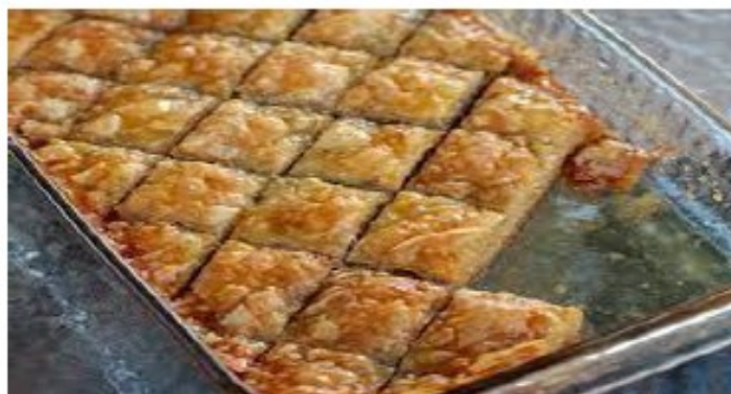
Baklava – Μπακλαβάς