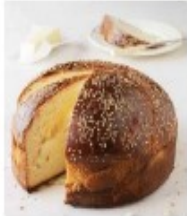
Vasilopita – Βασιλόπιτα

Pre-Orders Only to be picked up December 18 th and 19 th