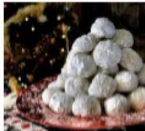
Kourambiedes – Κουραμπιέδες