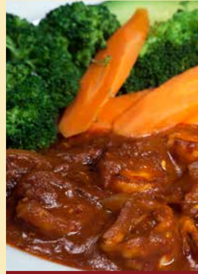
Camarones a la Diabla

* Our Red Enchilada sauce contains peanut butter.