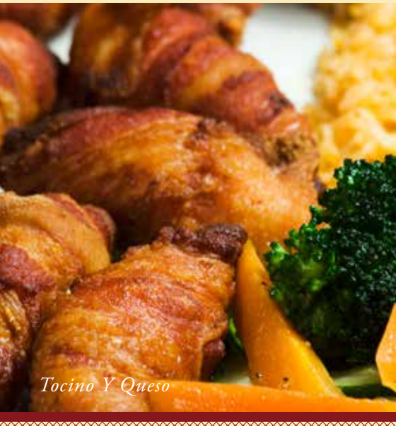
Tocino Y Queso