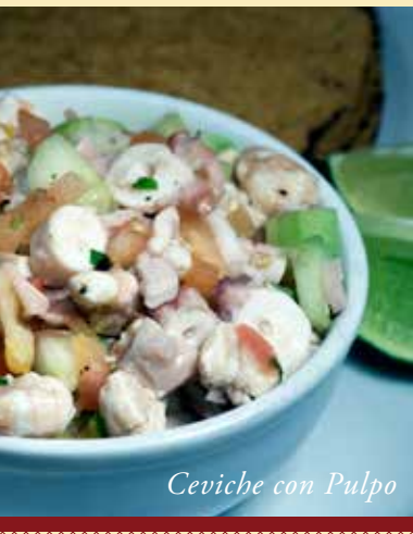
Ceviche con Pulpo