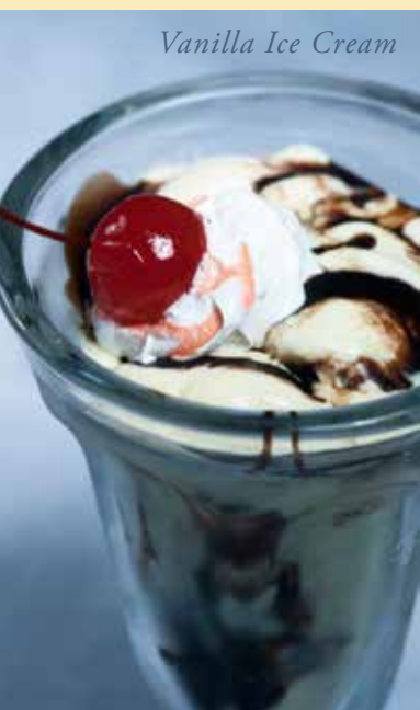
Vanilla Ice Cream