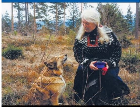
A Dogwise Training Manual