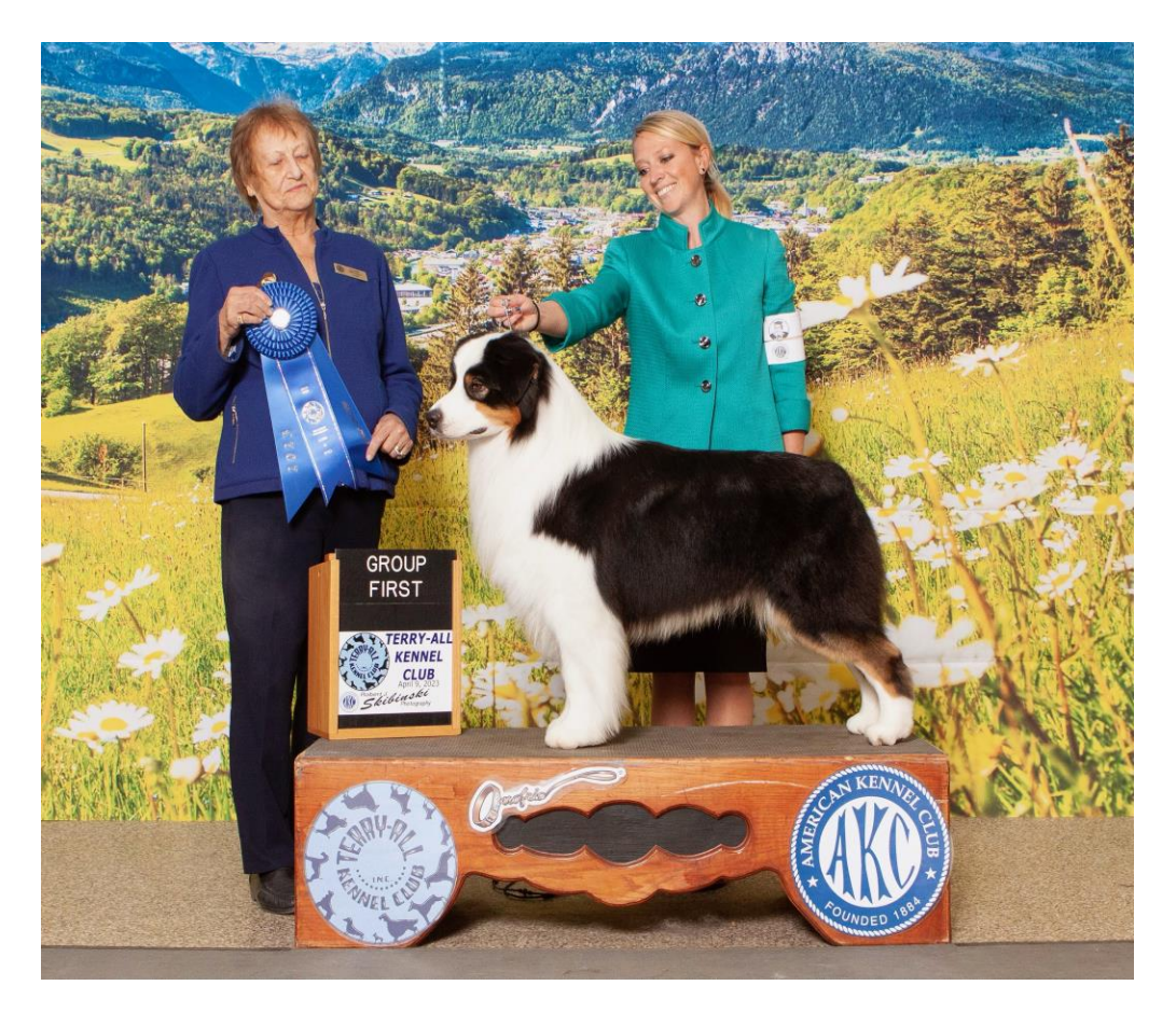
Multiple Group Winning, Multiple Group Placing, BISS RBIS GCH HHK MAKE IT A DOUBLE (Dually). Currently #4 in All Breed Standings