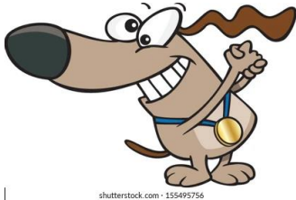
Graysee Mugg-my first bred by champion with 4 majors