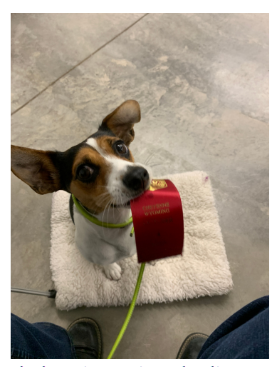
Second place in novice obedience! "Mae," Danish-Swedish Farmdog