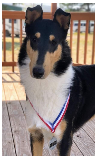
New Champion! Qualteri's Joie de Vivre at Meadowlark "Zest" Smooth Collie