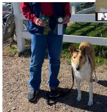
Echo Farm Dog Test and NACSW EST titles