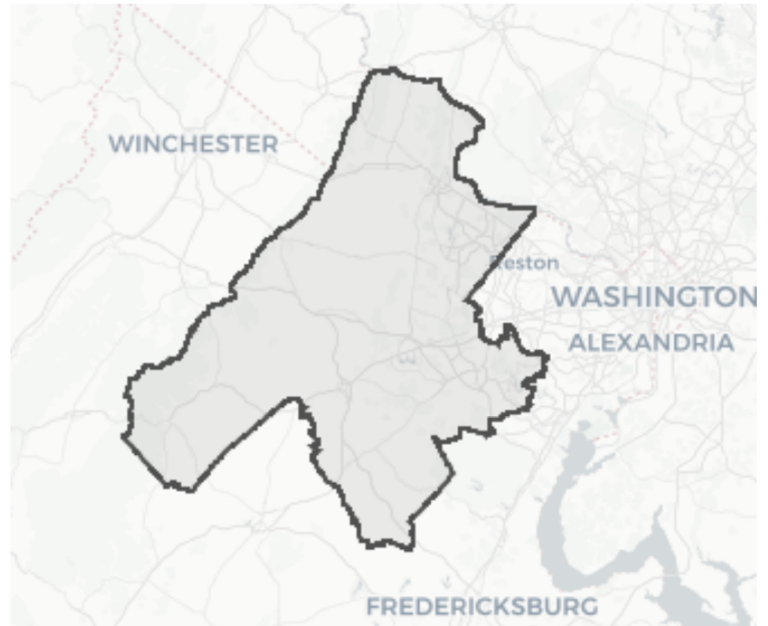
Virginia's 10th Congressional District