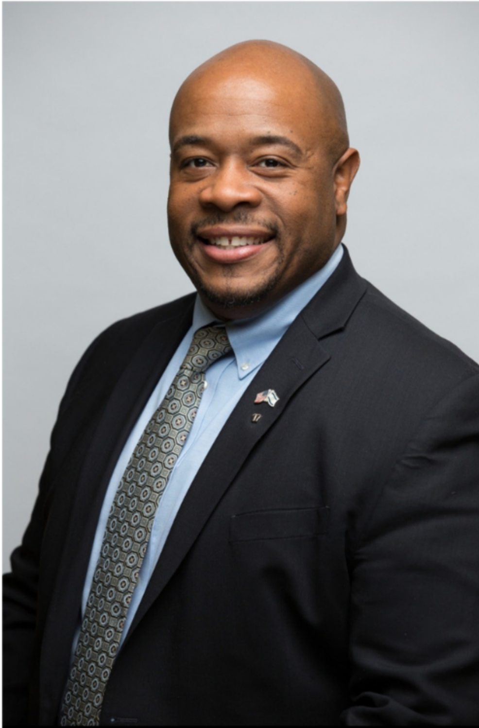
Terris Todd Headshot