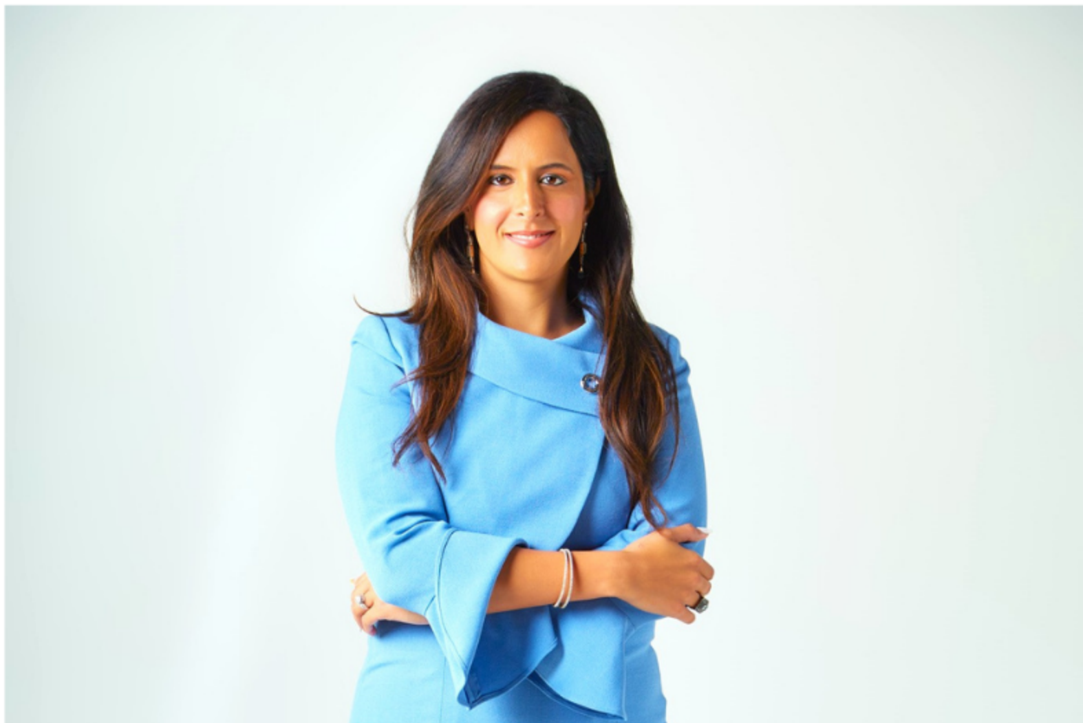
Krystle Kaul Photograph

Source: Krystle Kaul Campaign for Congress