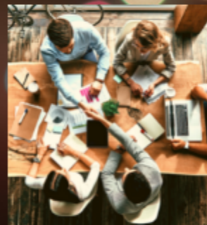
Behind The Scenes Staff

Transaction Coordinator Office Assistant Inside Sales Agent Professional Photographer(s) Sign Runners