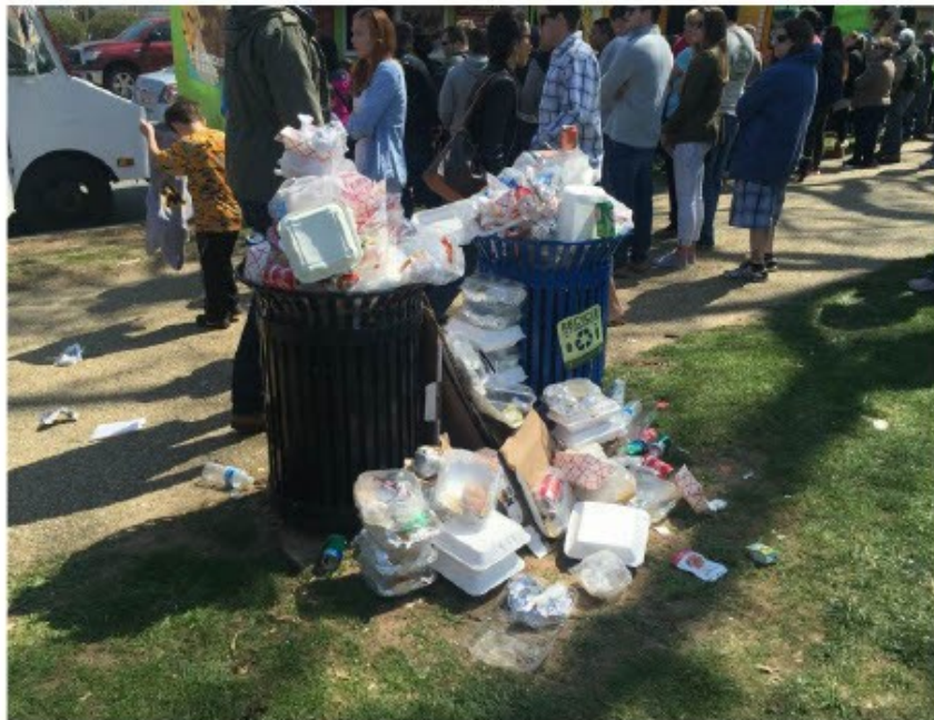
Figure 3: One of the many ways that plastics can enter the marine environment.