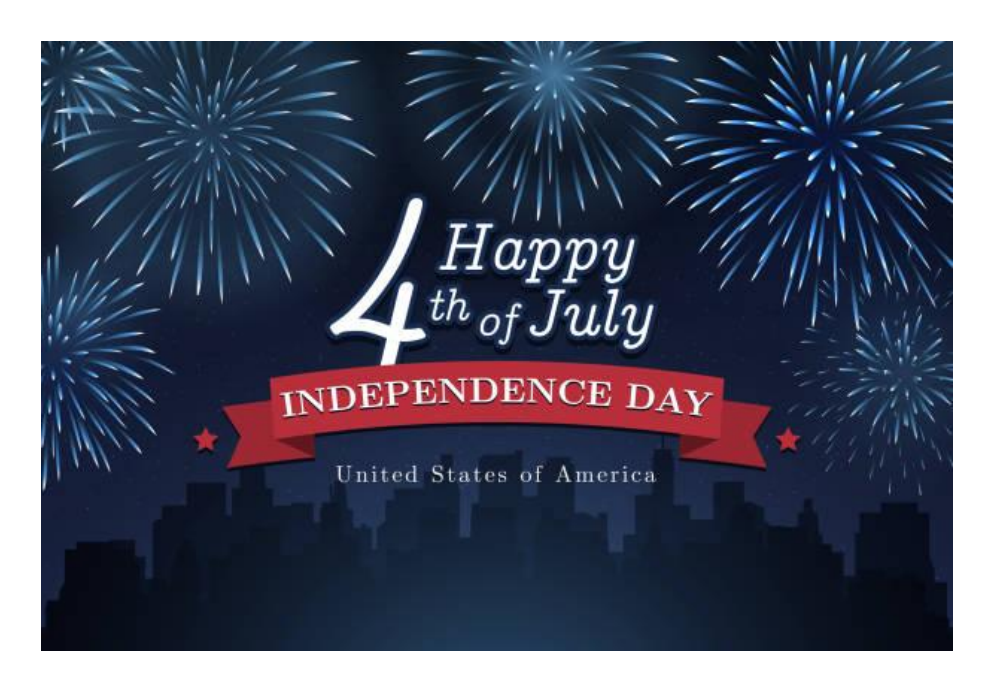
Holy Innocents' Clergy & Staff wish you a very safe and happy Independence Day!

Please pick up an updated directory as you leave. We will run another update to be released after Labor Day so if your information is still incorrect, GET IT INTO THE OFFICE PLEASE!