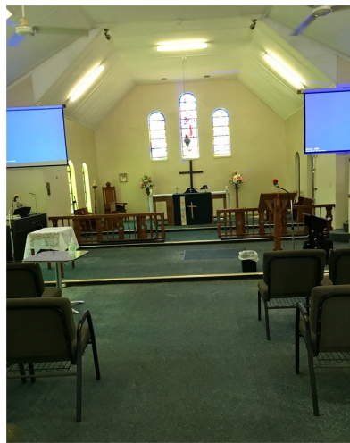
Holy Trinity Anglican Church, Blackall, Queensland