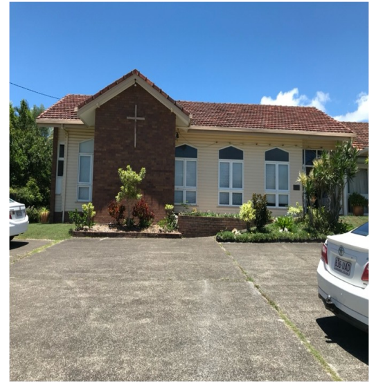
Good Shepherd Anglican Church Rainbow Beach