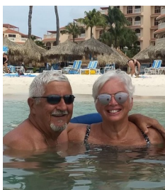
Aruba, our favorite!

And now these three remain: faith, hope and love. But the greatest of these is love.