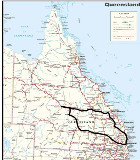
Black marking shows my route.