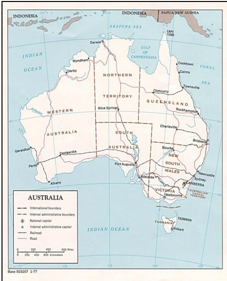
State of Queensland is in the North East of Australia.

In January 2023 I took a trip to my homeland, as I was wont to do each year when the cold weather in New Jersey became unbearable. By this time, I had sold all my cattle and a large part of my cattle station. I decided to take a road trip around some of Queensland's country towns and outback tourist spots I had never visited. I borrowed my nephew's old car, which, he assured me, was in good running condition. This turned out to be true but he didn't tell me the air conditioning barely worked. (I ended up spending a couple of hundred dollars to fill it with coolant). In every town I visited on a Sunday I attended the Anglican church in town. I was always welcomed warmly and invited to morning tea, which is Australian for coffee hour. Below is a map of where I went.