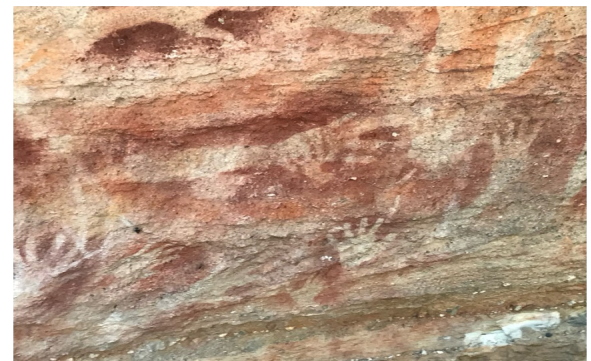
Painting of a boomerang and hands

I could go on with more pictures but I think this gives you an idea of outback Australia and its churches. There is an Anglican church in almost every town, big or small. And they welcome all comers with a worship service and morning tea!