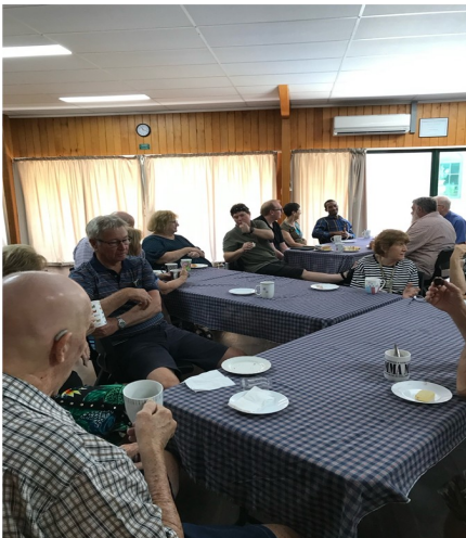
Morning tea at St. Luke's Anglican Church, Emerald, Queensland