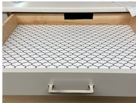
Lined drawer with mysterious cut-out!