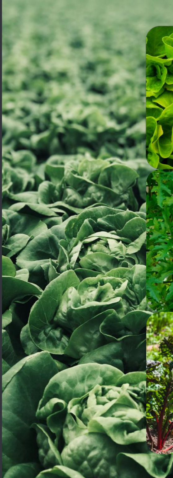
PHOTO DISCLAIMER: THE PICTURES ARE NOT OWNED BY THE SIMS FARMS, LLC AND ARE USED FOR GENERAL INFORMATION