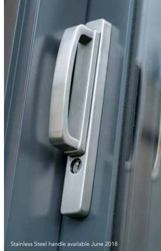
Stainless Steel handle available June 2018

Each door is also fitted with a high security 'Anti-Snap' and 'Anti-Bump' Yale Platinum 3 Star cylinder, designed to provide maximum security against known cylinder attack methods.