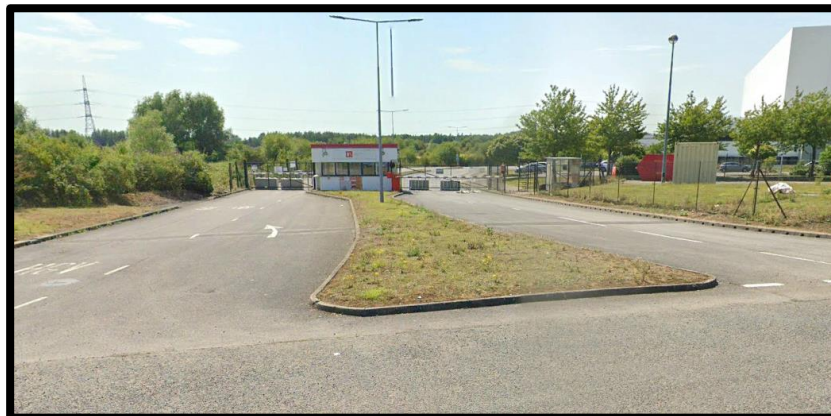
East Gate Access off Celtic Way.

At the site entrance, do not obstruct Celtic Way. Proceed into site and follow instructions and delivery / collection protocol as instructed by Security and Site Management team.