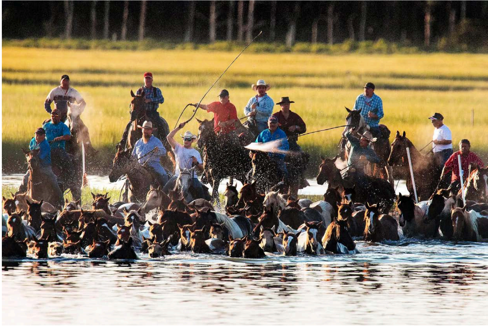
Saltwater cowboys drive Assateague wild ponies into the Assateague Channel during the annual Chincoteague Island Pony Swim in Chincoteague Island on July 26, 2017.