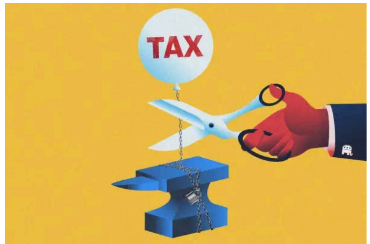
As Republicans Push for Tax Cuts, Here Are the Obstacles They Face