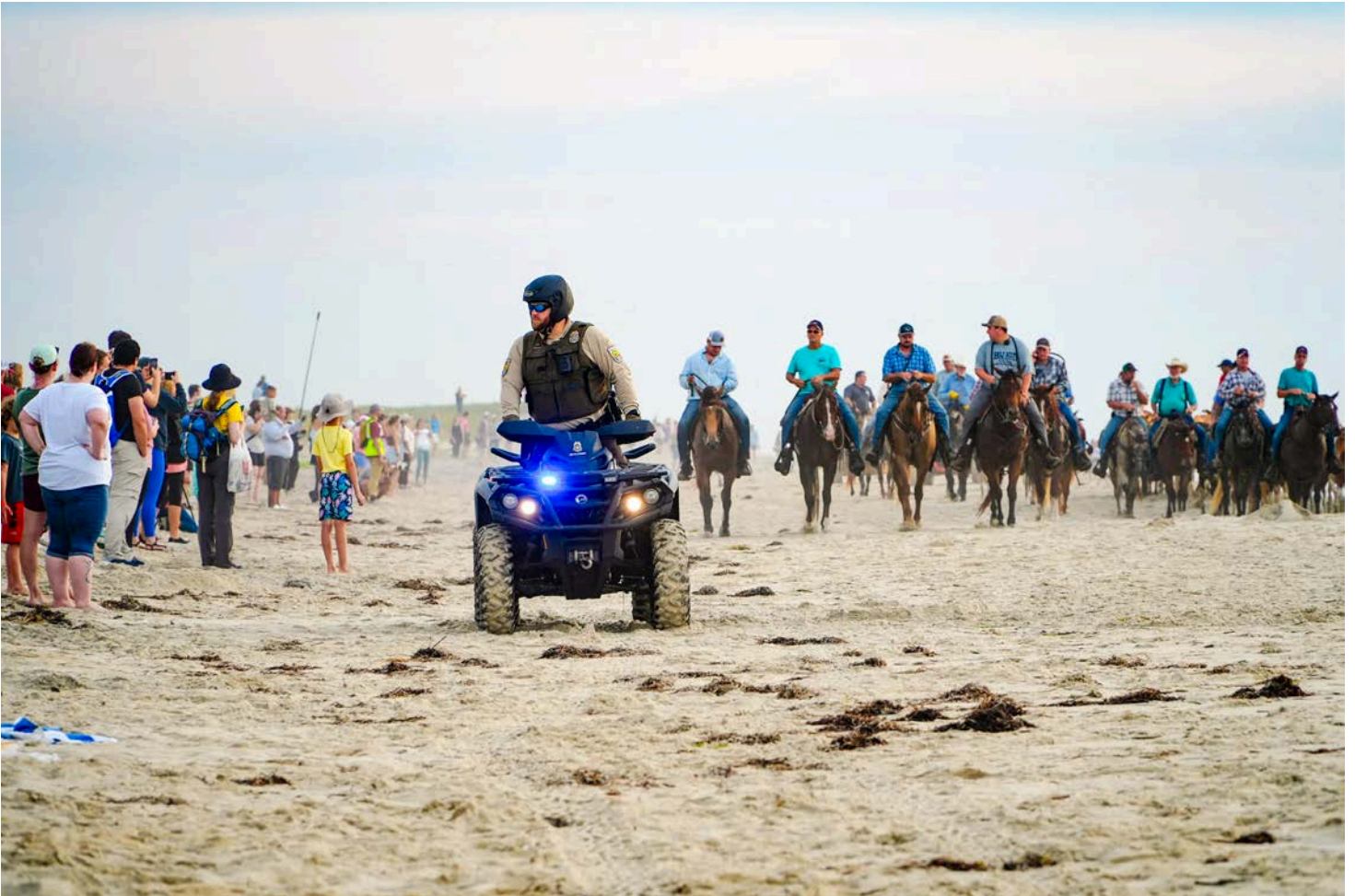
Thousands of people line the beach at sunrise to watch "saltwater cowboys" bring the local herd of wild ponies in to corrals, on Assateague Island on July 22, 2024.

Surrounded by volunteers on horseback, stallions, mares, and foals amble along the water's edge, then down a narrow marsh-lined road to a corral.