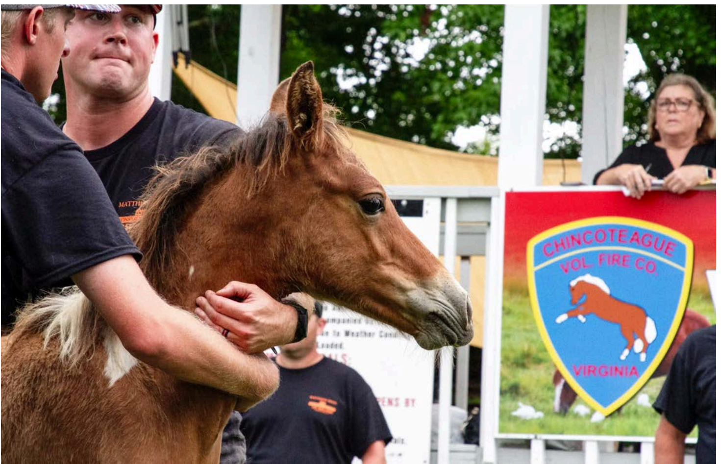
The annual auction for wild ponies on Chincoteague Island, Va., on July 25, 2024.

Henry visited the island at the urging of her publisher and fell in love with the people, the seafaring culture, and the ponies.