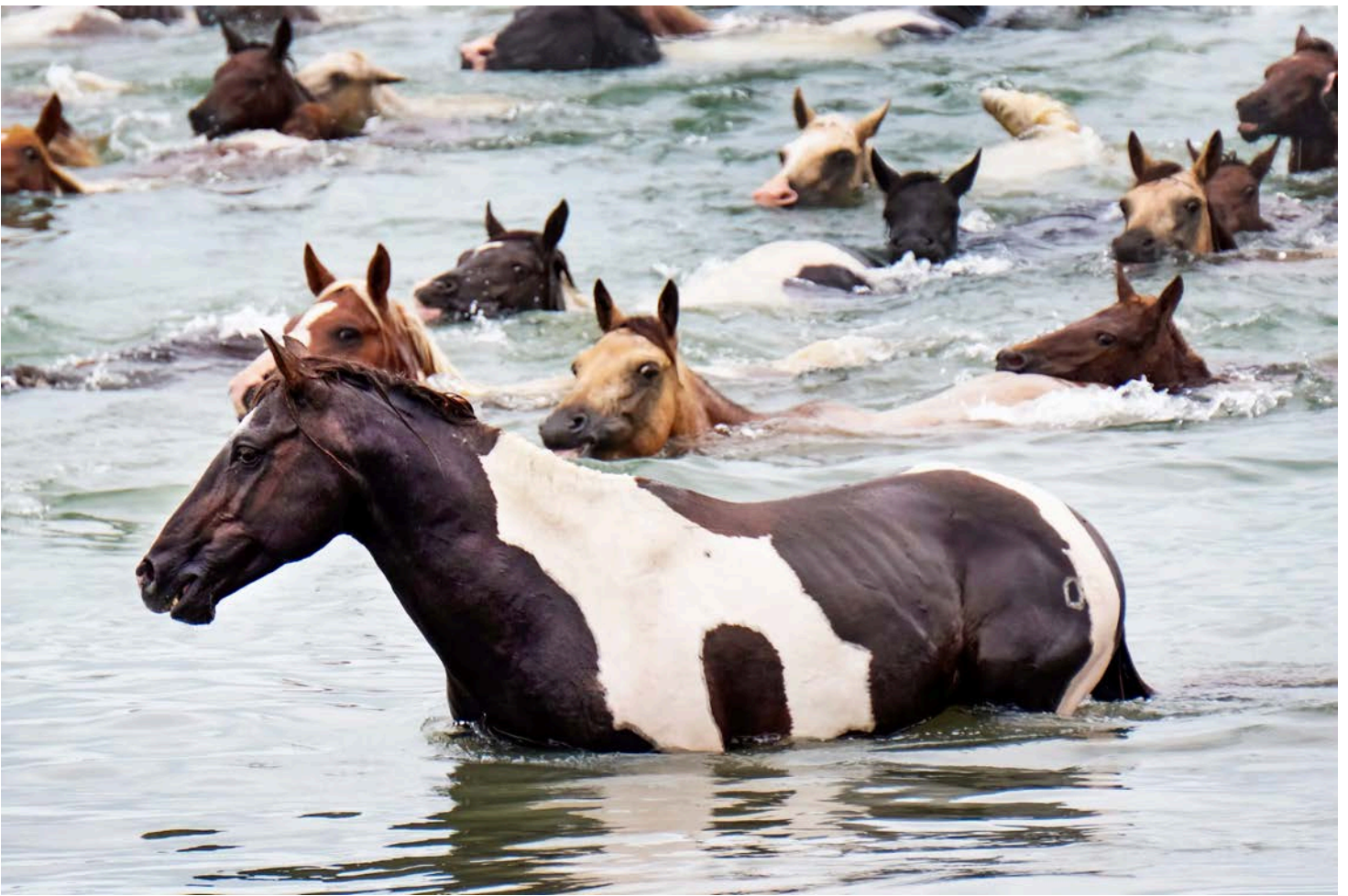
The wild ponies return to shore during the Chincoteague swim.

The first foal to the shore is crowned King Neptune or Queen Neptune. That baby horse will be the prize for the winning raffle ticket holder at the carnival that night.