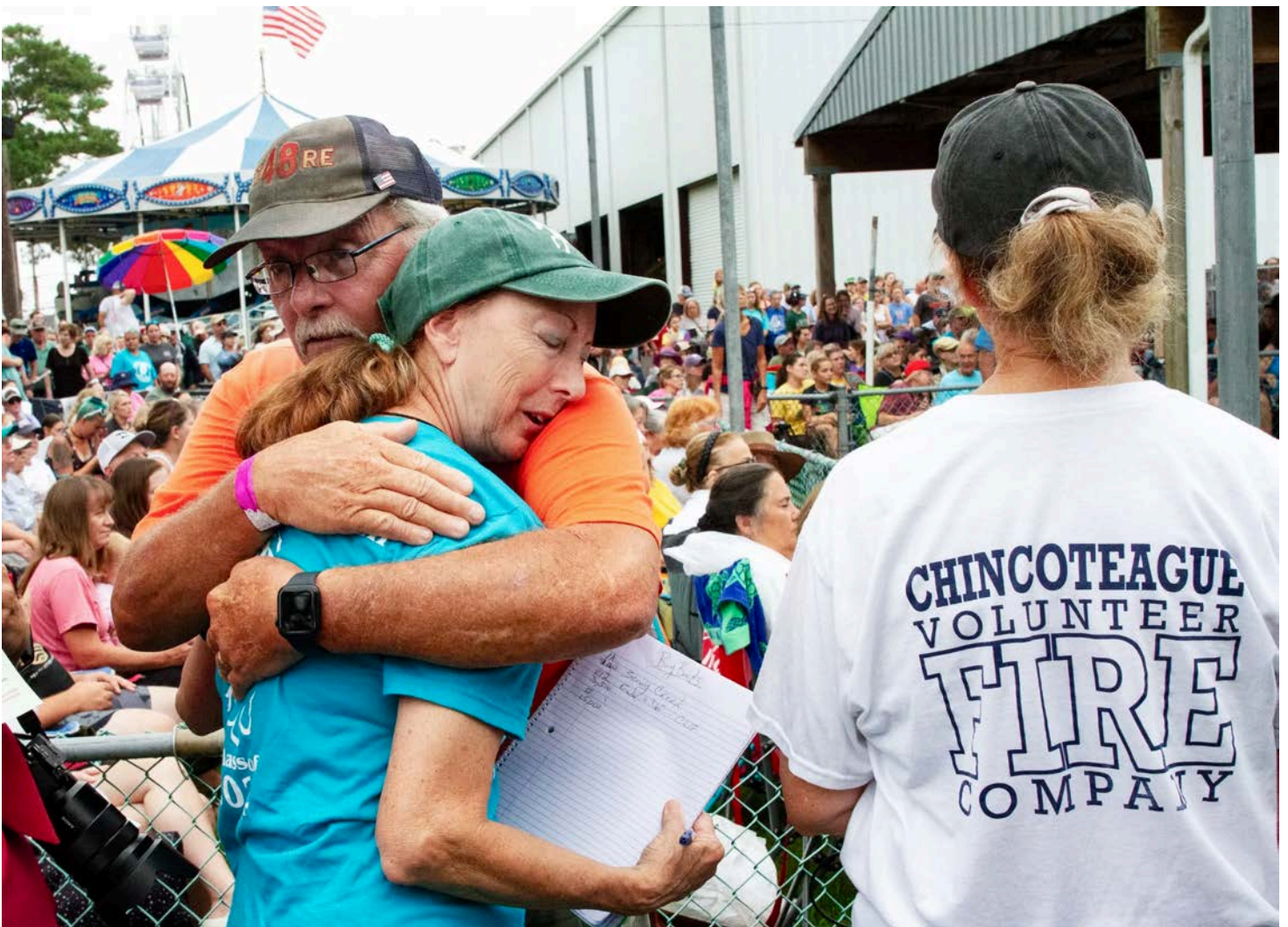
An upset bidder who wanted to buy a Chincoteague pony in memory of a beloved friend is being comforted after losing out to an online bid on July 25, 2024.

Bidders who don't win often shed not-so-happy tears.