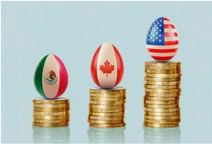
Why Eggs Are Cheaper in Mexico and Canada