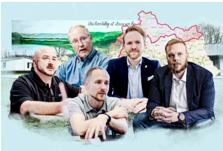
We Went to Thomas Massie's District. Here's How They Feel About His 'No' Vote on Funding.