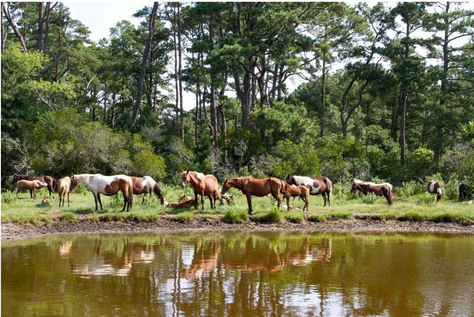
Wild ponies relax on Assateague Island after swimming to Chincoteague Island, on July 24, 2024, and then back again on July 26, 2024.