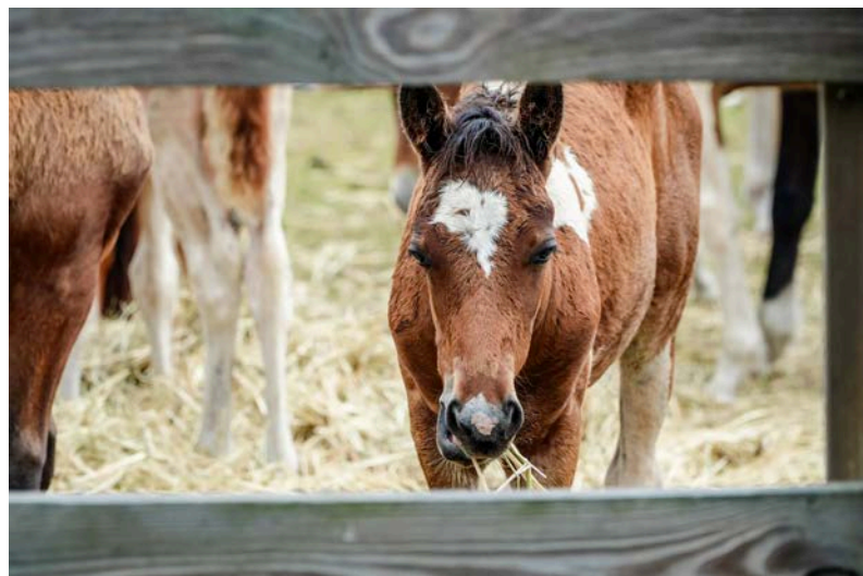
(Top) A pony herd await for inspection on Assateague Island on July 22, 2024. (Bottom Left) Wild Chincoteague ponies rest in their corral before an annual auction on Chincoteague Island. (Bottom Right) A weanling foal munches hay and looks out from the pony corral at people trying to see the herd on Assateague Island on July 22, 2024.

Through the board fence, pony fans watch foals nurse from the mares and nap in the sun.