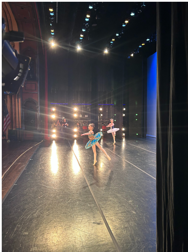
Maeve warming up before her classical solo.