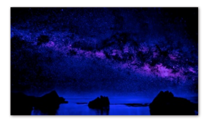
ATTRACTOR or a RELEASOR Black appears entropic next to light - frozen in time in its current state.

Nature has its own brush of metal colors, Iridium has all colors condensed into black and is one of the layers on earth. Iridium lucky 77 with somewhat of a mirrored finish. The decay of nickel with cobalt gets darker over time and is a part of the earth's inner core and can leak into the oceans changing the shape of the land.