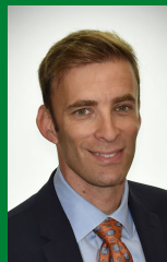
JD, Q. Med

Mediating Cannabis Related Disputes as applied to multi-residential buildings, such as condominiums, strata, & rental apartments