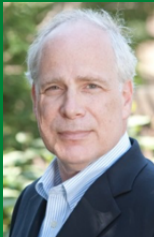
C. Arb., LL.M (ADR), LL.B

The Legislation & Regulations that apply to Cannabis