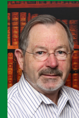
C. Med, C. Arb

Problem-Solving/Mediating with Management's & Union's Considerations in Mind