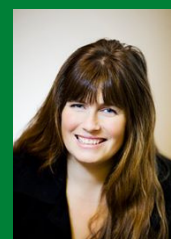
C. Med, Q. Arb, LL.B