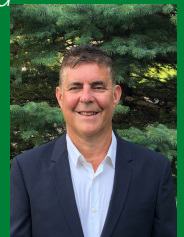
C. Med, C. Arb, LL.B

Learn about Prevention & Set-Up for Problem-Solving in the Future, how to use a Mediation/Facilitation Approach, and Mediator Skills & Techniques to navigate potential workplace issues.