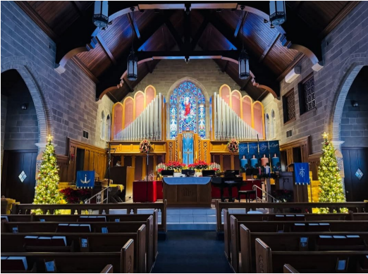
St. John's during the "most magical time of the year"