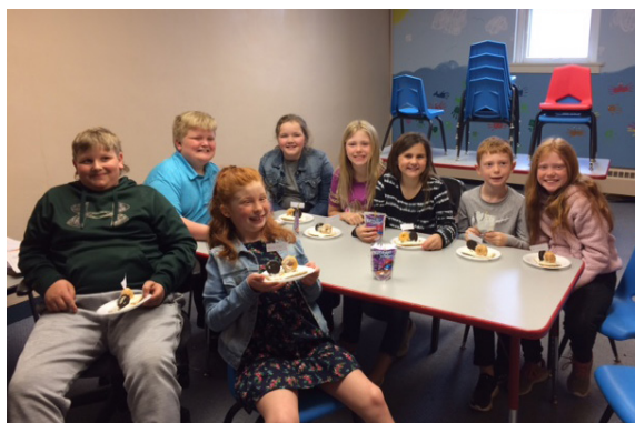
Kids from "He Is Risen" project.