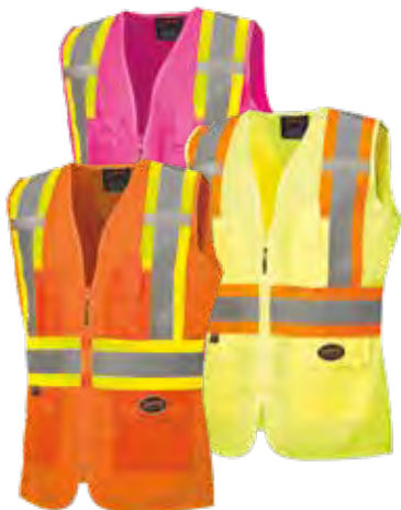
V1021840U V1021860U V1021850U