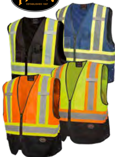
V1021571U, V1021580U V1020251U, V1020161U