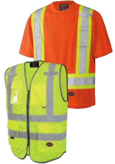
CLASS 2—TYPE R AND/OR P