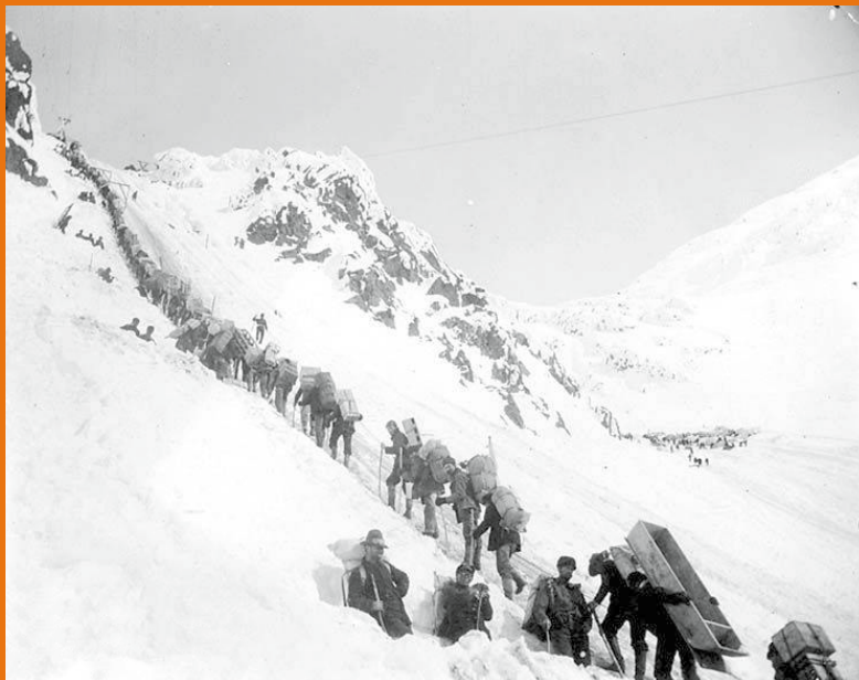
Klondikers carrying supplies ascending the Chilkoot Pass, circa 1898

Today Pioneer offers a complete selection of safety clothing including Hi-Vis gear, flame resistant wear, rainwear and much more... plus custom embroidery solutions. SureWerx combines Pioneer with the rest of the SureWerx family of safety brands to offer protection to workers from head to toe.