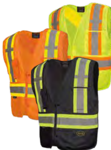
V1021260U V1021150U V1021170U