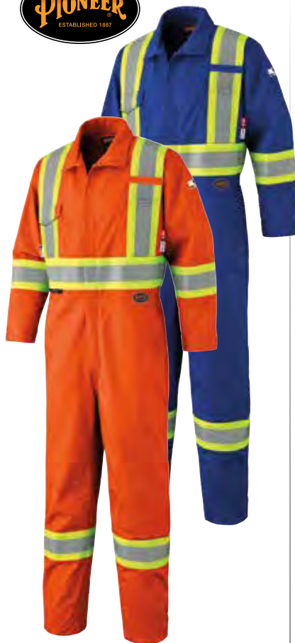
V2540310, V254031T V2540350, V254035T