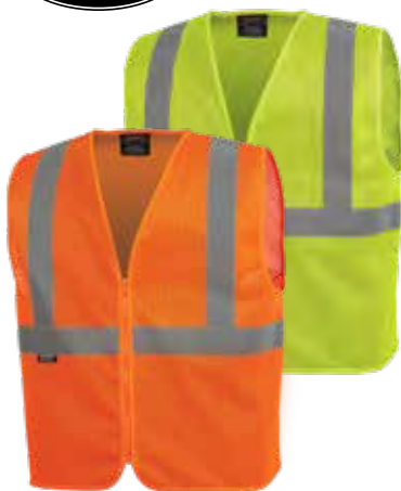
V1060360U V1025060U V1025050U