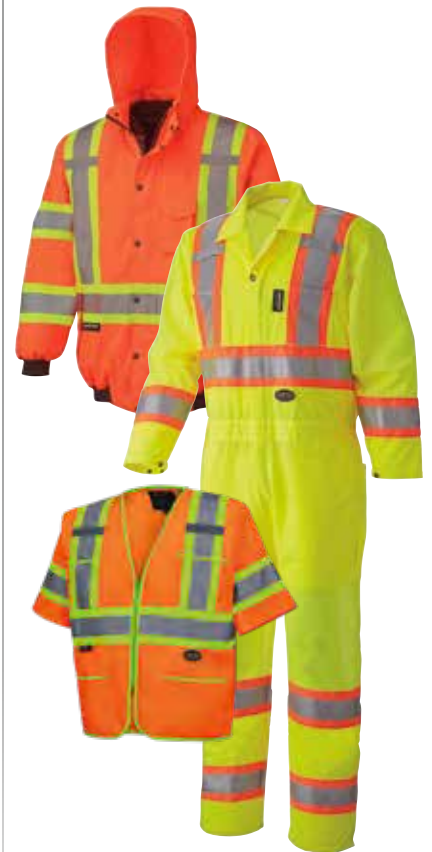
CLASS 3—TYPE R AND/OR P