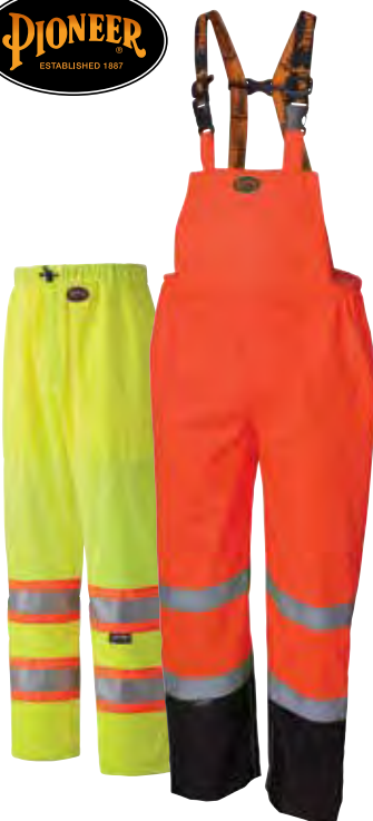
SUPPLEMENTAL CLASS E