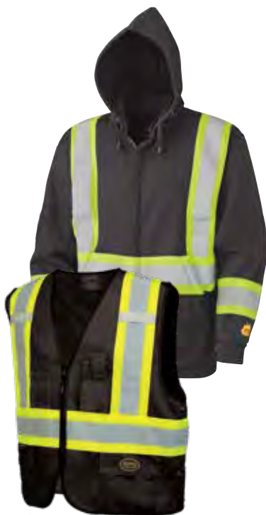
CLASS 1—TYPE O