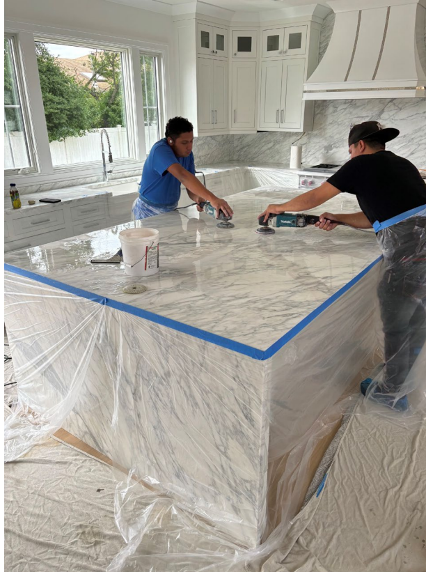
Team resurfacing the island.