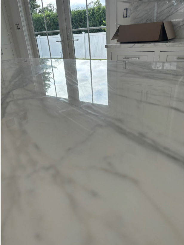
Visible scratch marks on natural stone island.