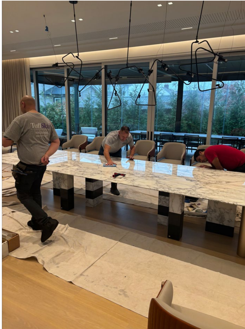
Resurfacing & Tuff Skin installed