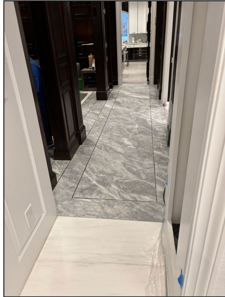
Honing marble floors