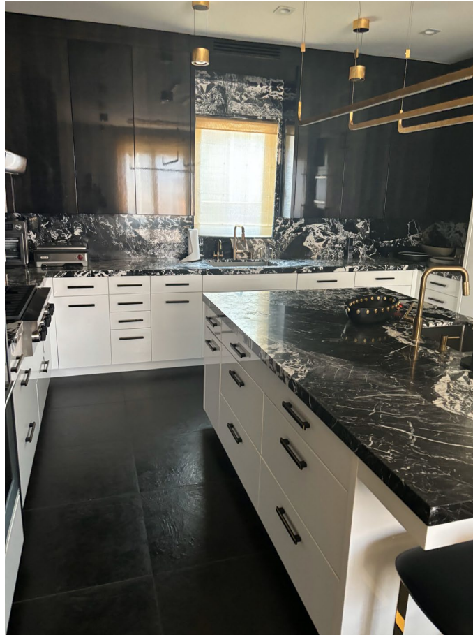
Tuff Skin installed