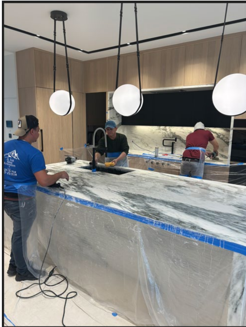
Resurfacing & Tuff Skin installed