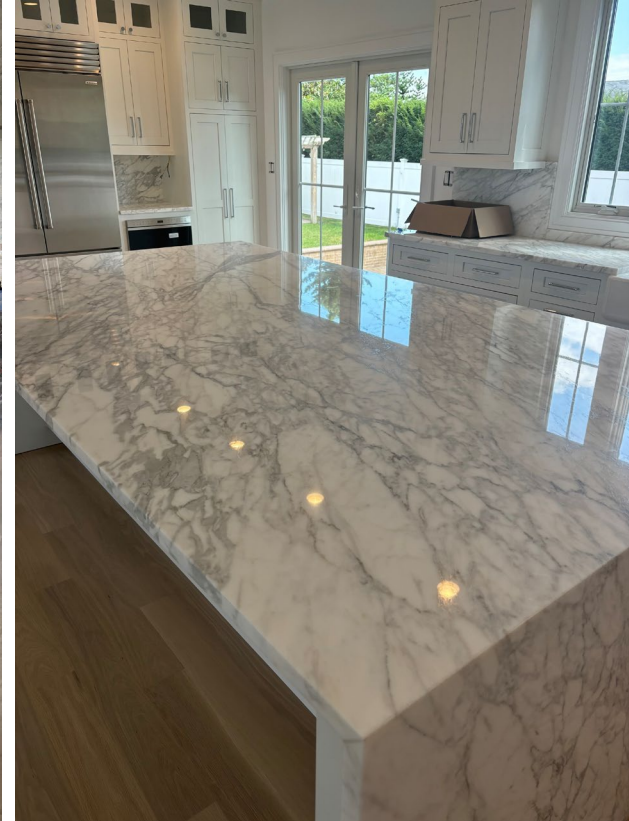
End product, scratches are removed.