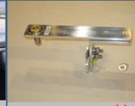
**new** BKT_ToyotaTrac-2 for trucks WITH bed cover