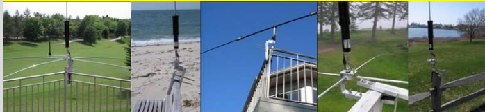
7 antenna bases for HF/V/UHF Buddipole™ base & WiFi Kit