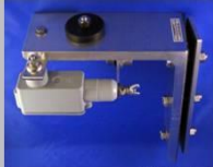
1/2" thick x 3" wide x 8" long backing plates 2x8" or 2x6" V/UHF - large HF antennas