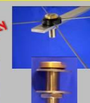
NMO Optional Radials (135-512 MHz)