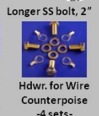
Hdwr. for Wire Counterpoise -4 sets-