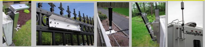
Mounts Vertical wood & metal fences, railings