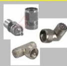
"The Real Deal" Amphenol Connectors