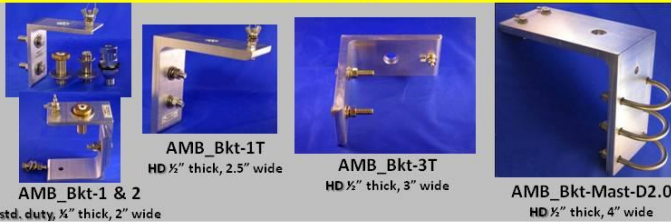
AMB_Bkt-1T HD ½” thick, 2.5” wide