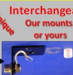
SHD-SO239-LA (ant. bolt SO239 adapters)