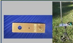
AMB-TripodAM-1 HF/V/UHF Antenna Mount for Camera Tripods