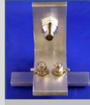
BKT_ToyotaTrac-1 for trucks WITHOUT bed cover