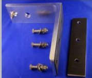
Aluminum & Stainless Steel rubber backing protects paint fits inside stake pocket