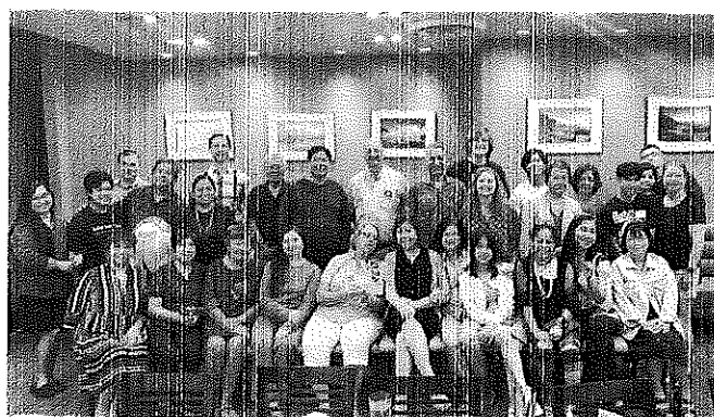
Retirement Party Oct. 21 st , 2023 - Guam