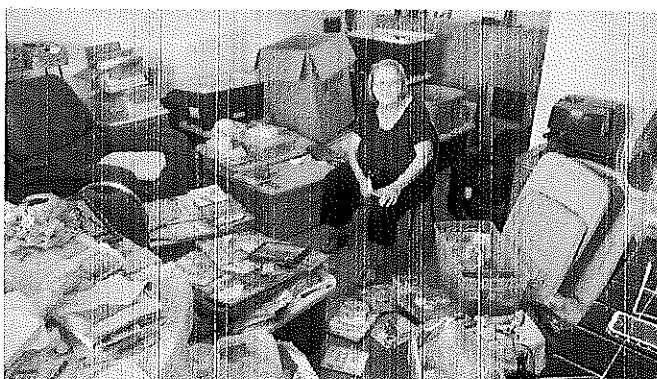
Sorting and packing 38 yrs of living in Micronesia