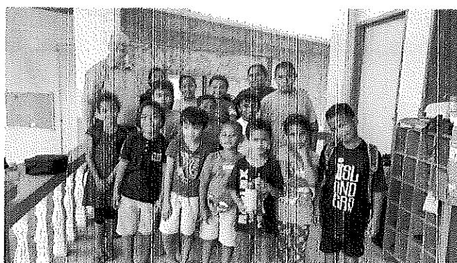
Yap International Christian School Grades 1-3