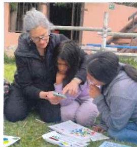
Art project in the yard