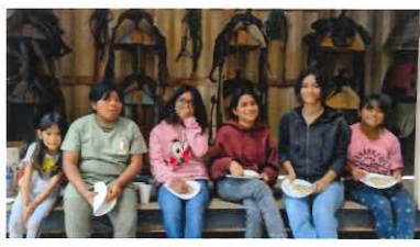
Quesadillas in the tack room