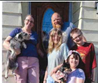
The Gonzalez Family Office & Administration