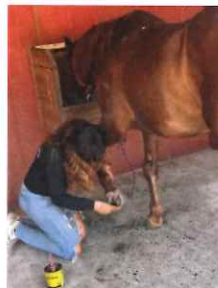
Caring for the horses