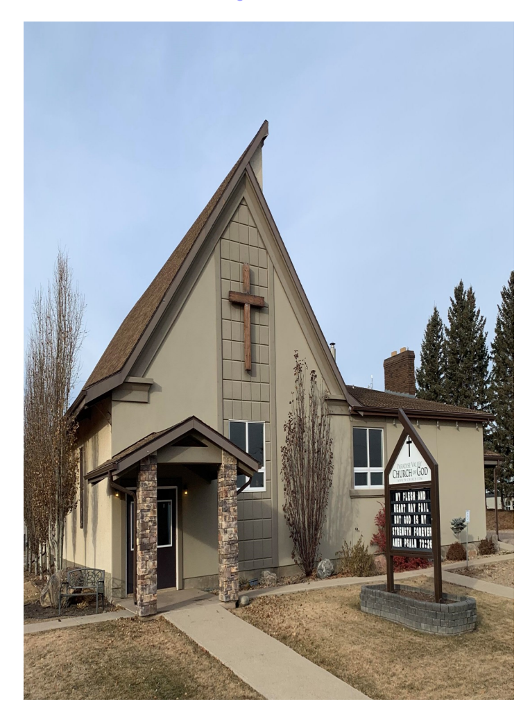
Isaac Brundage July 28, 2024