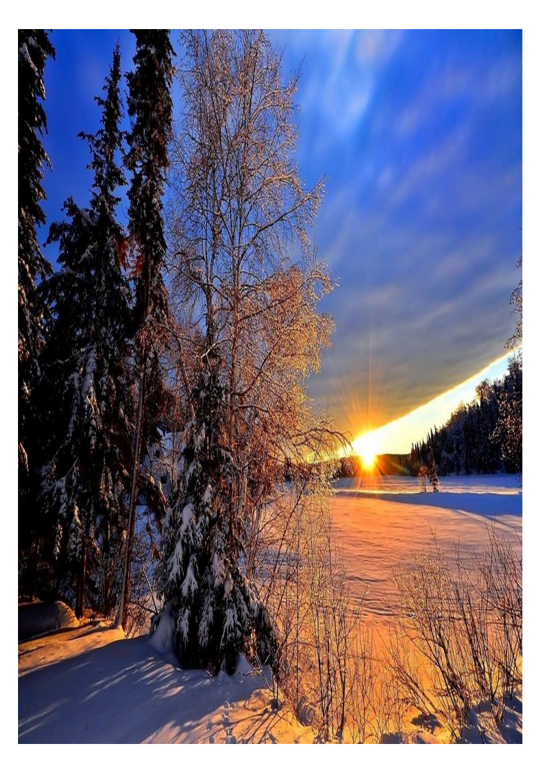
December 29, 2024