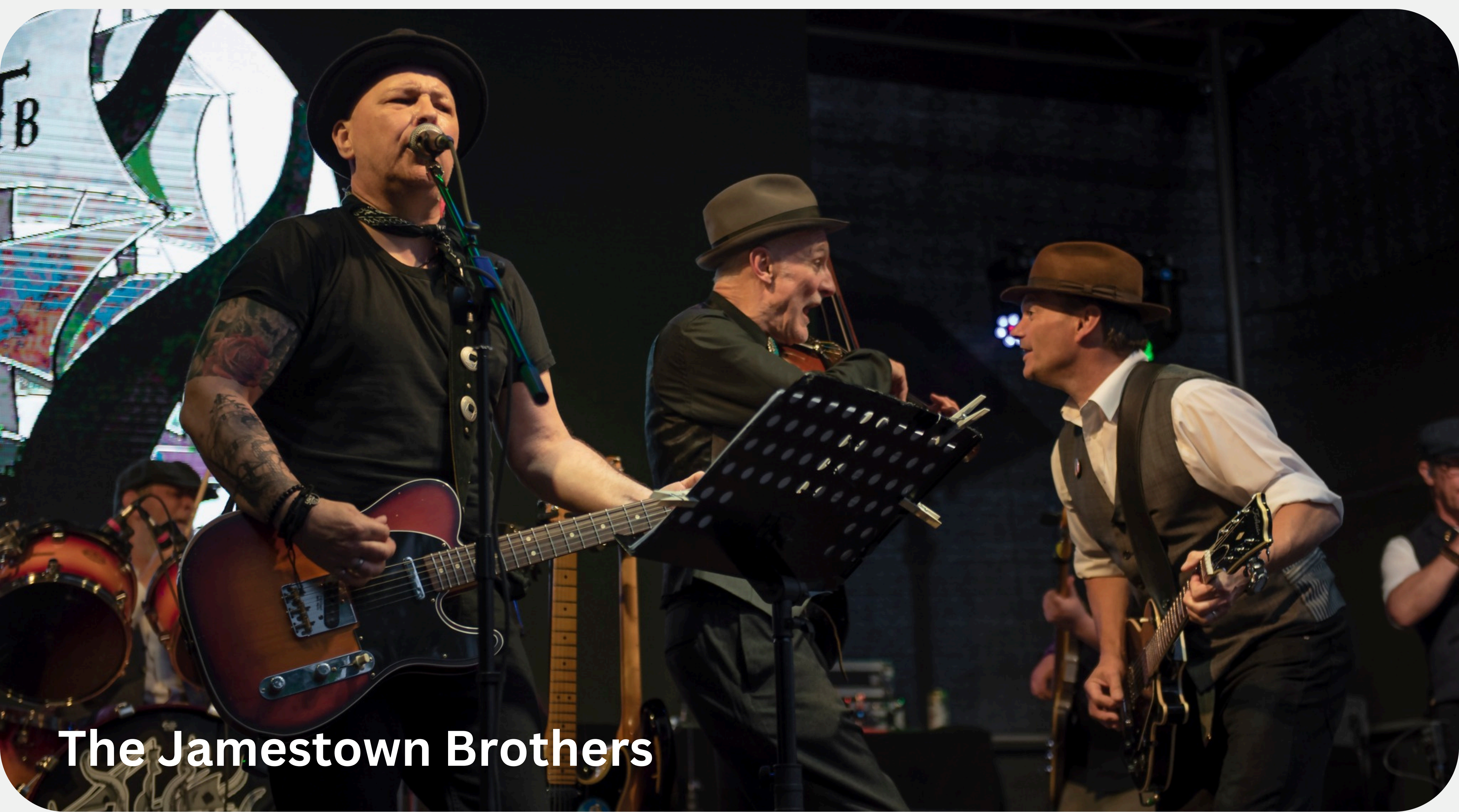
The Jamestown Brothers

This nine-piece collective mix a variety of country and Celtic influences. Staying true to the storytelling roots of folk, the Jamestown Brothers present an exciting and anthemic array of melodic sounds, ensuring the folk punk genre continues to remain in safe hands. With a unique line-up of instruments, they create a huge live sound with high energy.