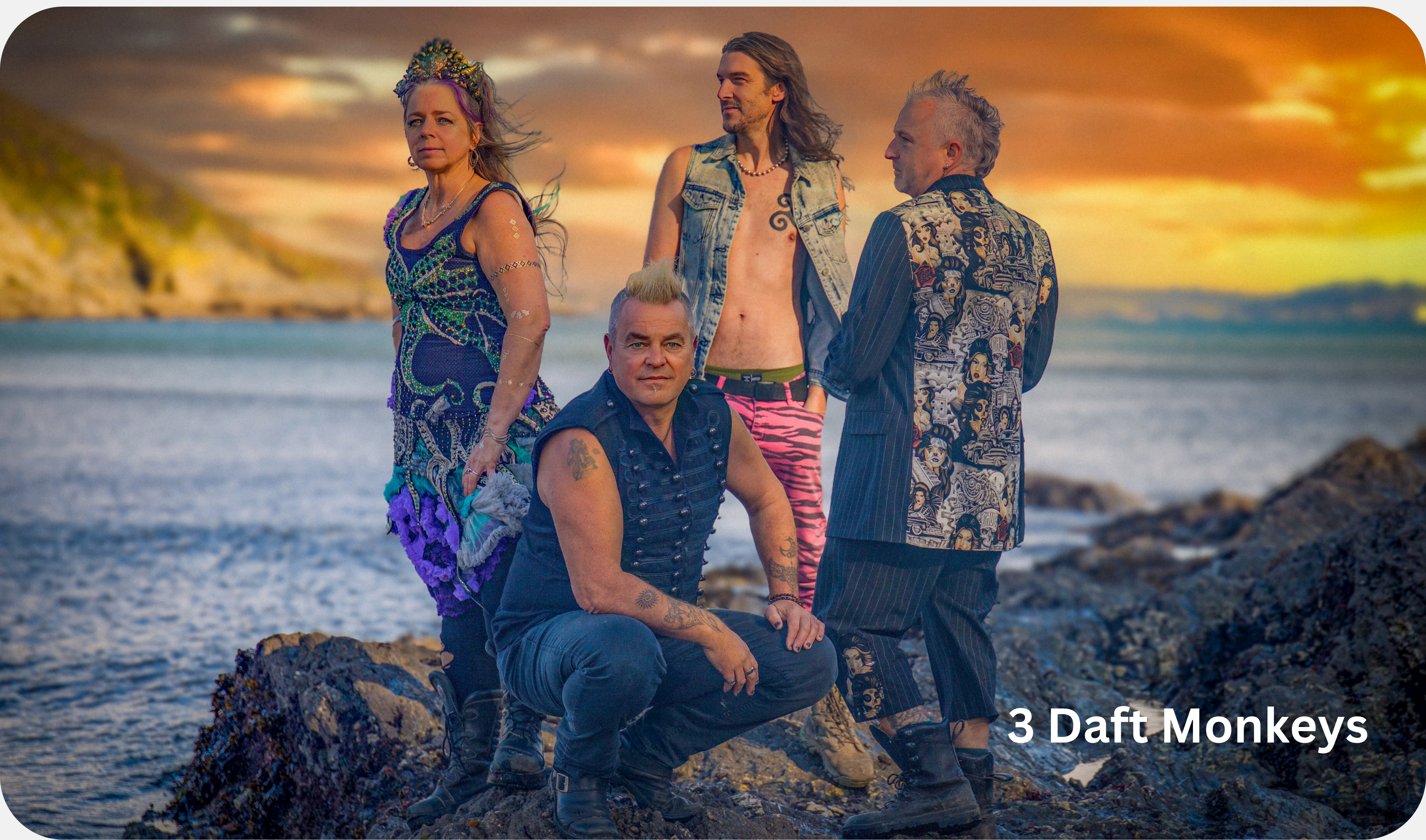
3 Daft Monkeys