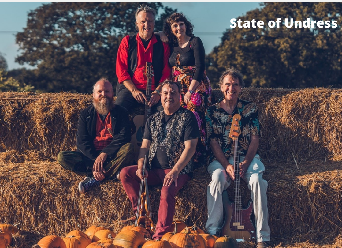
State of Undress

State of Undress are a difficult band to pigeon-hole. Their songs move from the poignant and provocative to the downright shamelessly foot-tapping! With music that's 'a blend of roots, rock, country, Celtic flavourings and a full-bodied melodic musical assault' (R2 Rock n Reel), State of Undress promise you a musical roller-coaster of a gig...oh, and they do have a bit of thing going on with some shaky eggs!