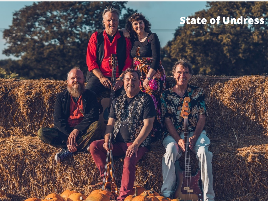
State of Undress

State of Undress are a difficult band to pigeon-hole. Their songs move from the poignant and provocative to the downright shamelessly foot-tapping! With music that's 'a blend of roots, rock, country, Celtic flavourings and a full-bodied melodic musical assault' (R2 Rock n Reel), State of Undress promise you a musical roller-coaster of a gig...oh, and they do have a bit of thing going on with some shaky eggs!