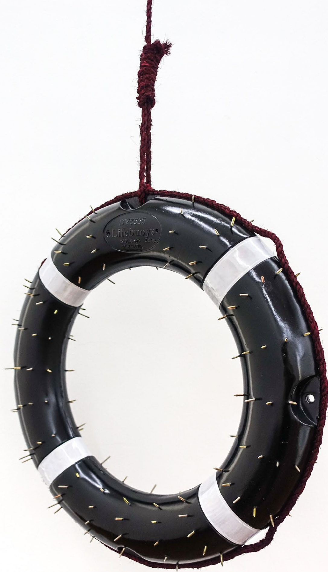
Come Sit With Me 2018 Ring buoy, screws and rope 75 x 75 x 18 cm