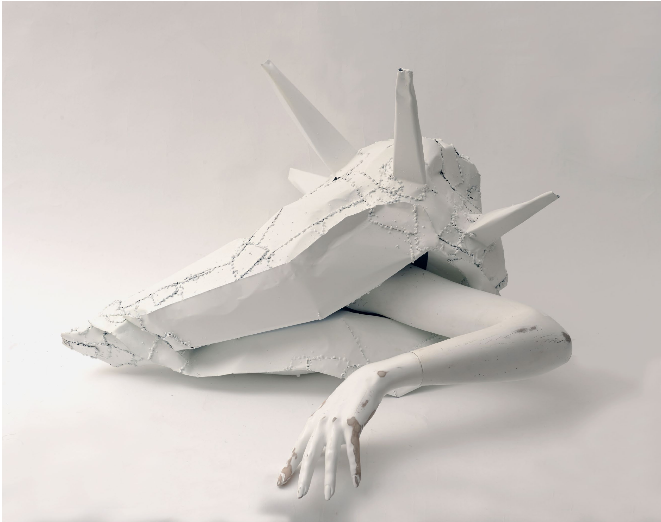
Carapace I 2019 Steel and mannequin arm 43 x 70 x 67 cm