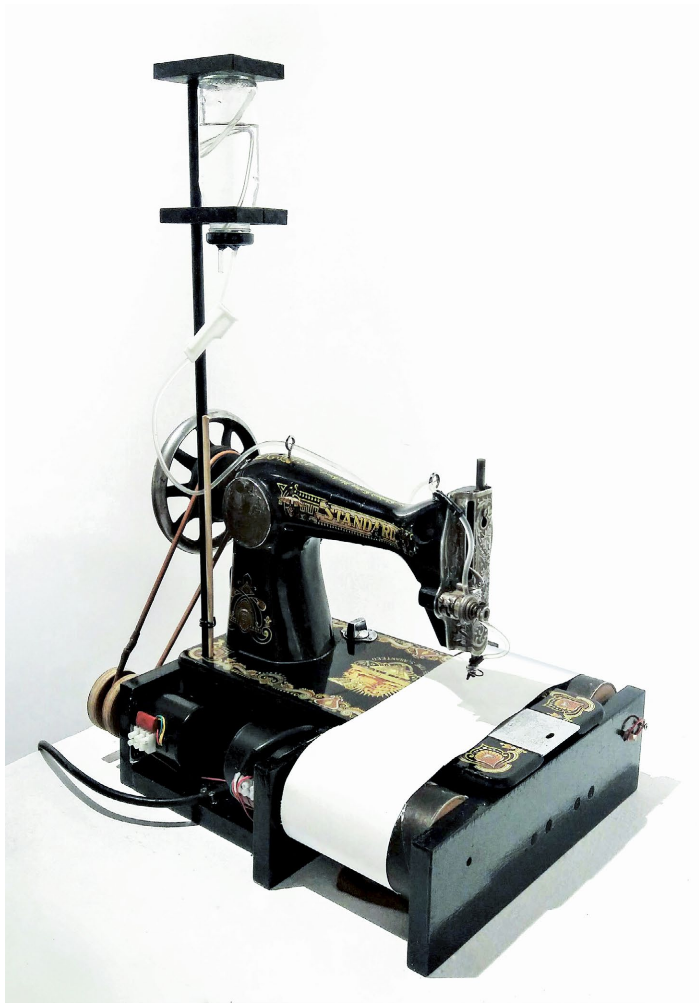
Untitled (Sewing Machine) 2017

Re-purposed sewing machine, paper and water 80 x 40 x 40 cm