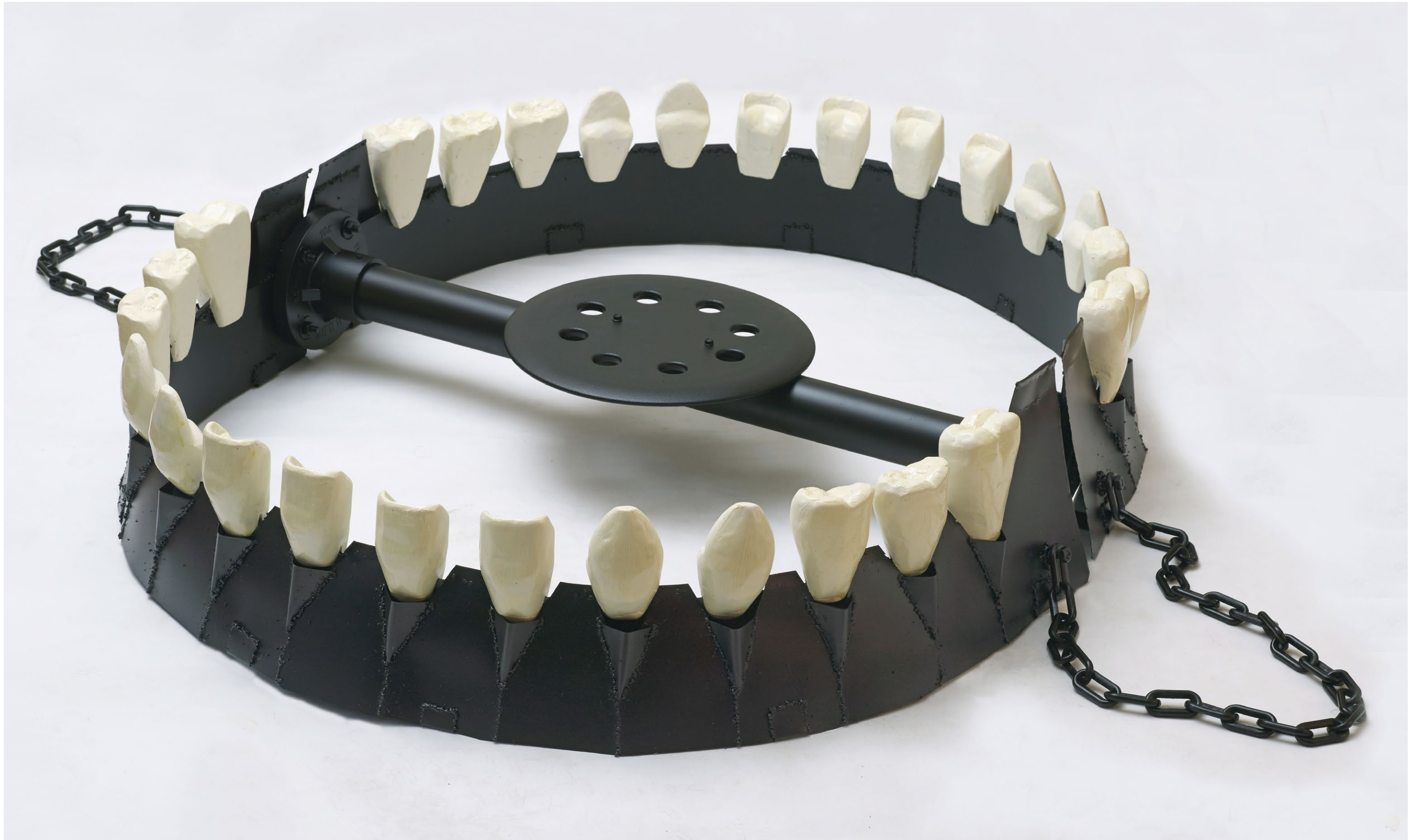
Gap Space 2019

Steel, fiberglass resin, stool top & decorative chain 24 x 133 x 122 cm