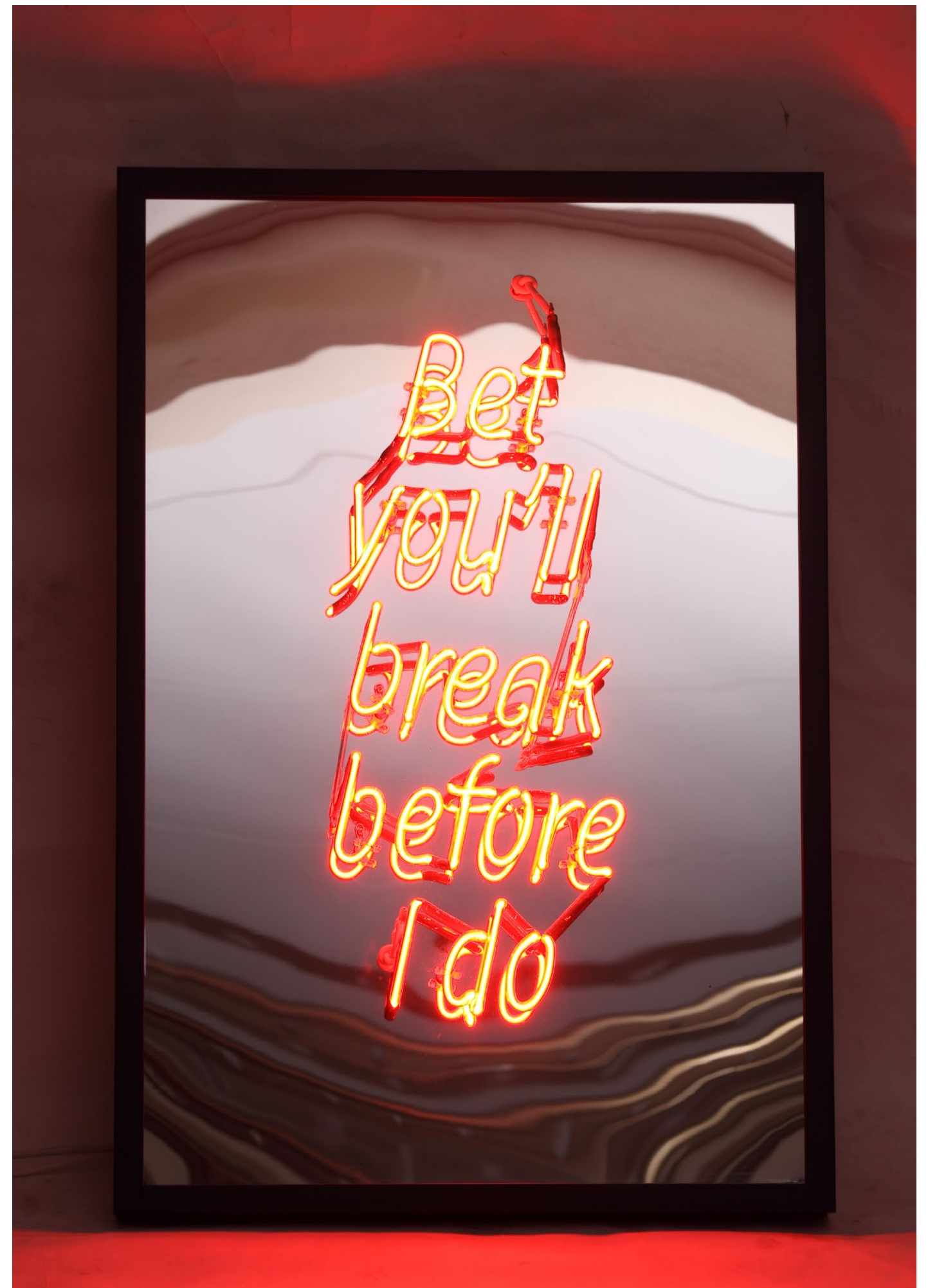
Bloody Mary 2019 Framed acrylic mirror and neon 95 x 64 x 7 cm