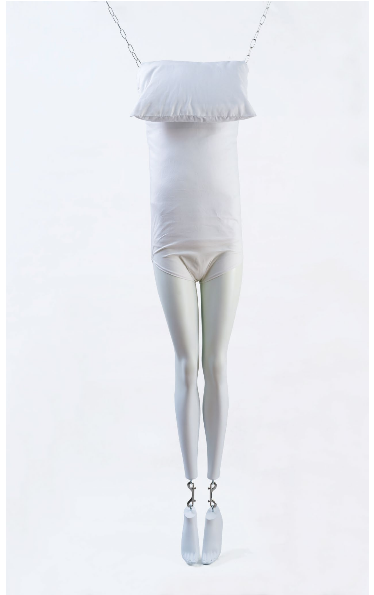
Mood II 2019 Fiberglass mannequin, canvas cloth, polyster fiber fill & PU foam 48 x 97 x 39 cm cm