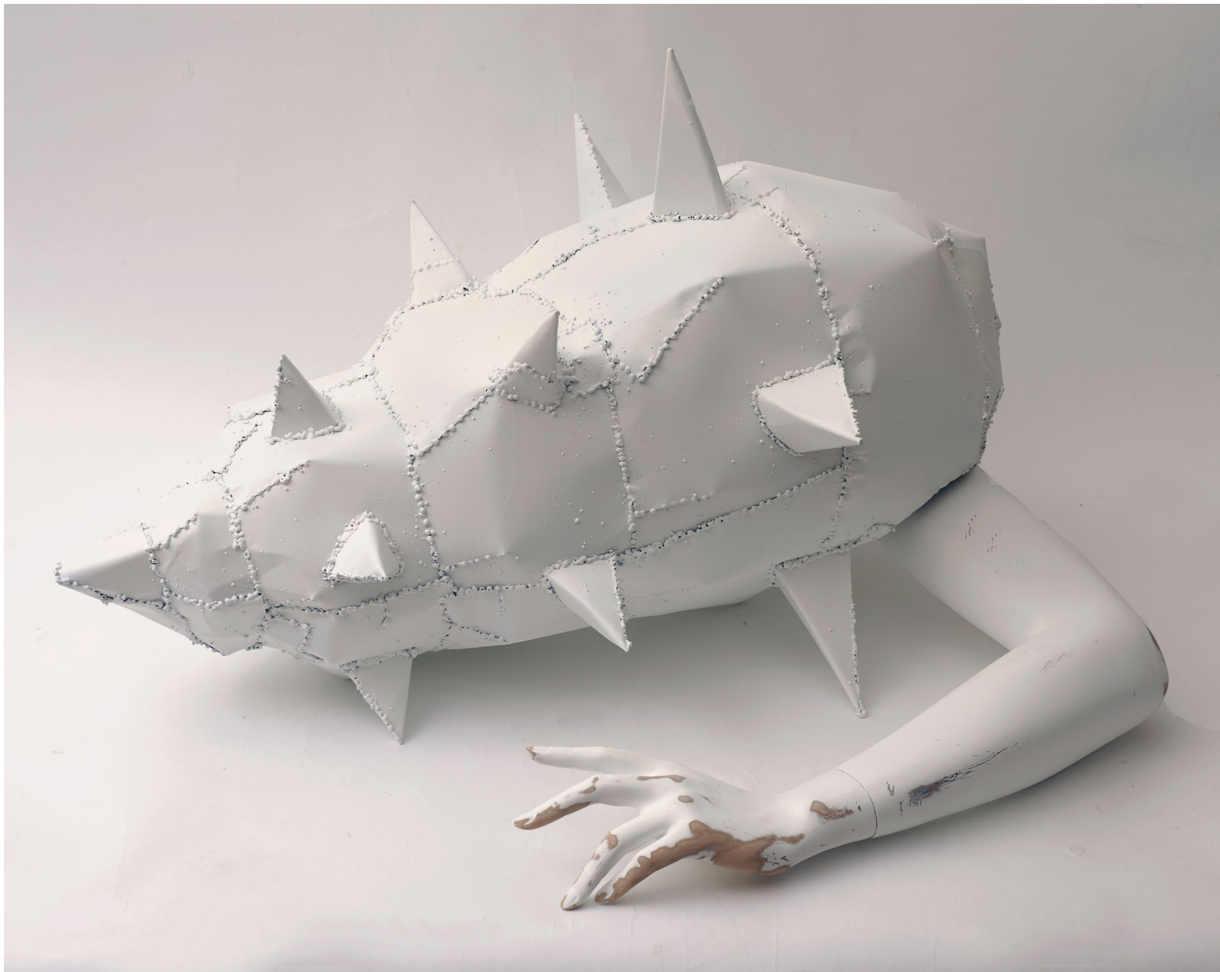
Carapace III 2019 Steel and mannequin arm 38 x 74 x 52 cm