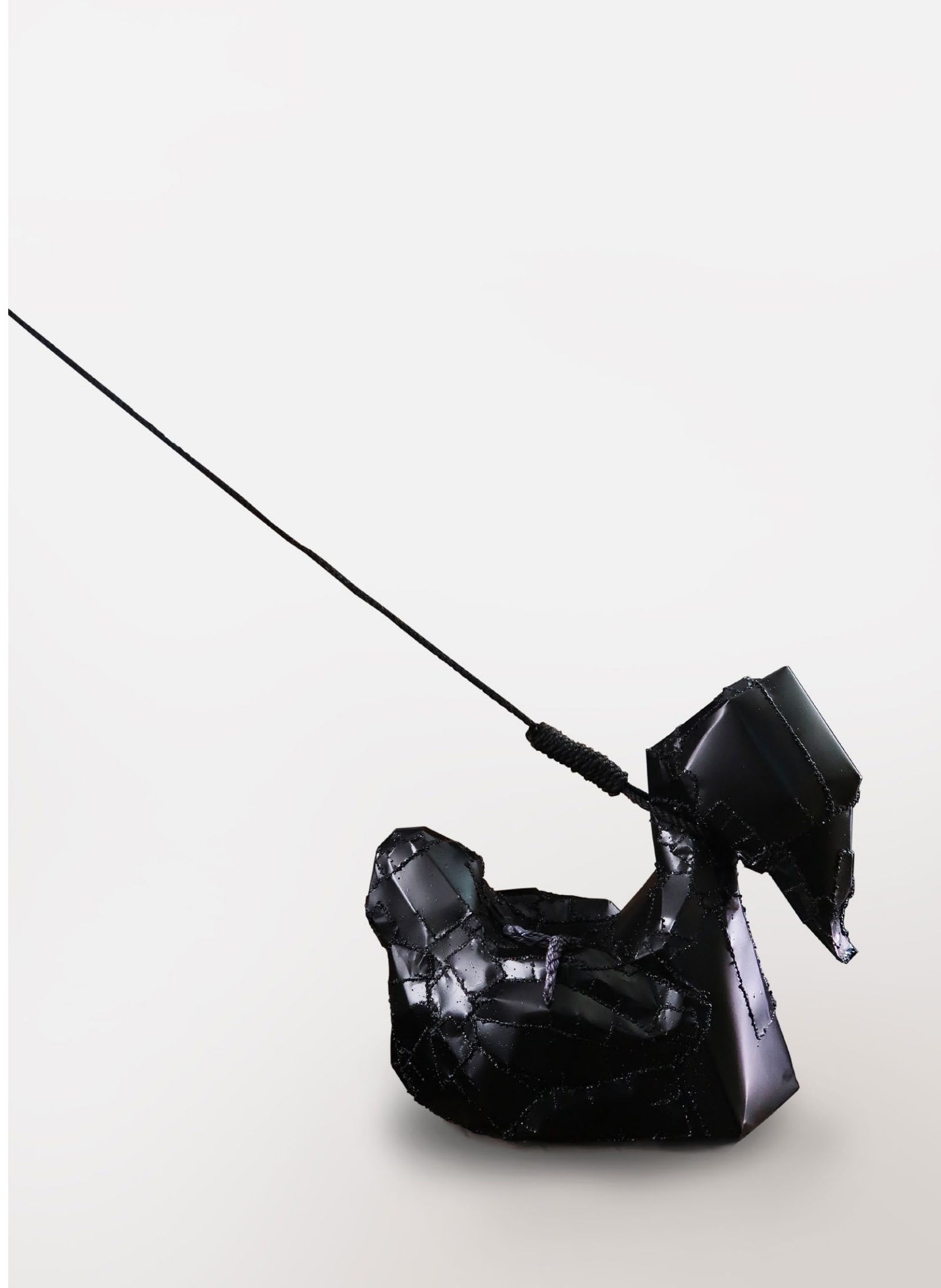
Swan Song 2018 Steel and rope 70 x 80 x 45 cm