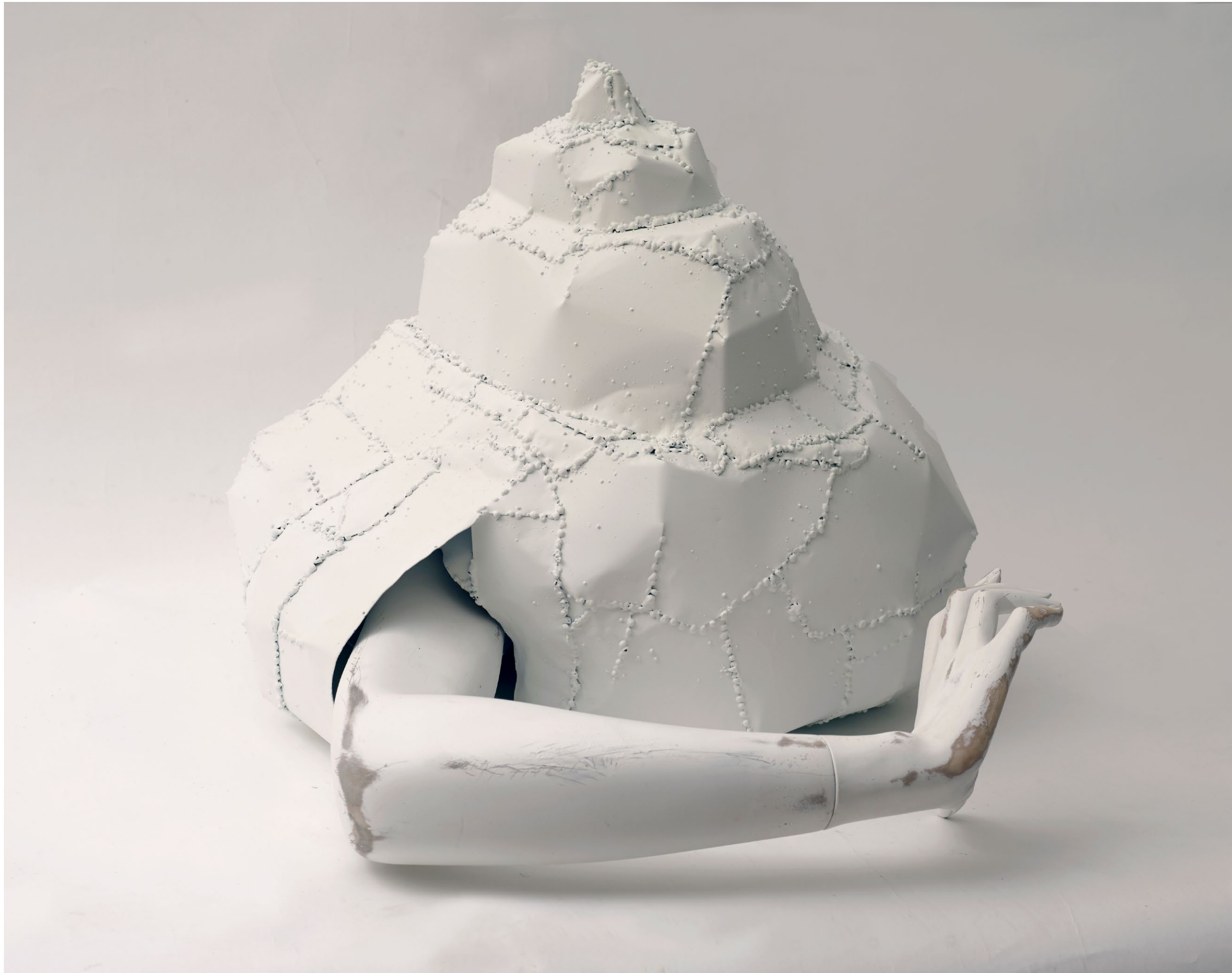
Carapace II 2019 Steel and mannequin arm 36 x 51 x 54 cm