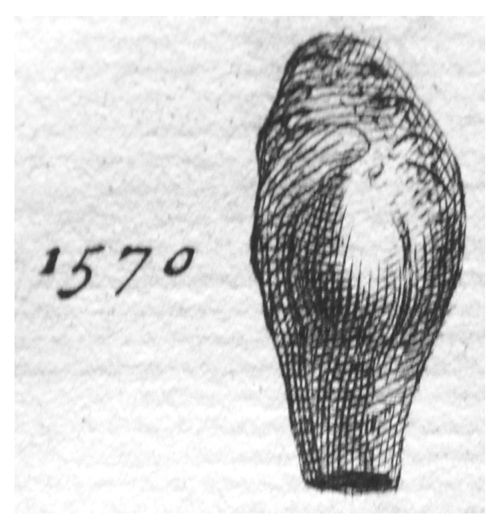
FIGURE 2. Possible microspiral heteropolar coprolite from the Corallian Group of Garford, Oxfordshire. Copper etching from Lhwyd (1699a, pl. 17).

The provenance of the specimen, Garford, is a small village, now in Oxfordshire but formerly part of Berkshire, around 6 km west of Abingdon and 14 km southwest of Oxford itself. Garford sits on a low