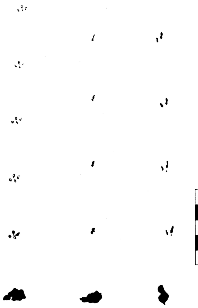
FIGURE 2. Tracings of dirty footprints in trackways made by Canada Geese in Golden Colorado in 2009, 2010 and 2011. All tracks were made in the same location on three separate years in January or February. In all cases the tracks were registered on a cement sidewalk after the geese had stepped in a future coprolite. See text for details.

In the case of the 2011 trackway, four dirty tracks were made by the left foot of a single individual (Fig. 2, Table 3), no later than Jan. 28th 2011. No right footprints were identified. The mean step length was 41.5 cm. In all three trackways the stride lengths are relatively consistent (mean between 39.8 and 41.5 cm) indicating a normal walking gait for a Canada Goose. The steps could not be measured, for the reasons explained above, but based on observations of Canada Goose trackways in soft substrates like mud or snow, where the trackways are relatively linear and narrow (Fig. 3), one can infer that step length is approximately half stride length: i.e., in the range of 20-21 cm