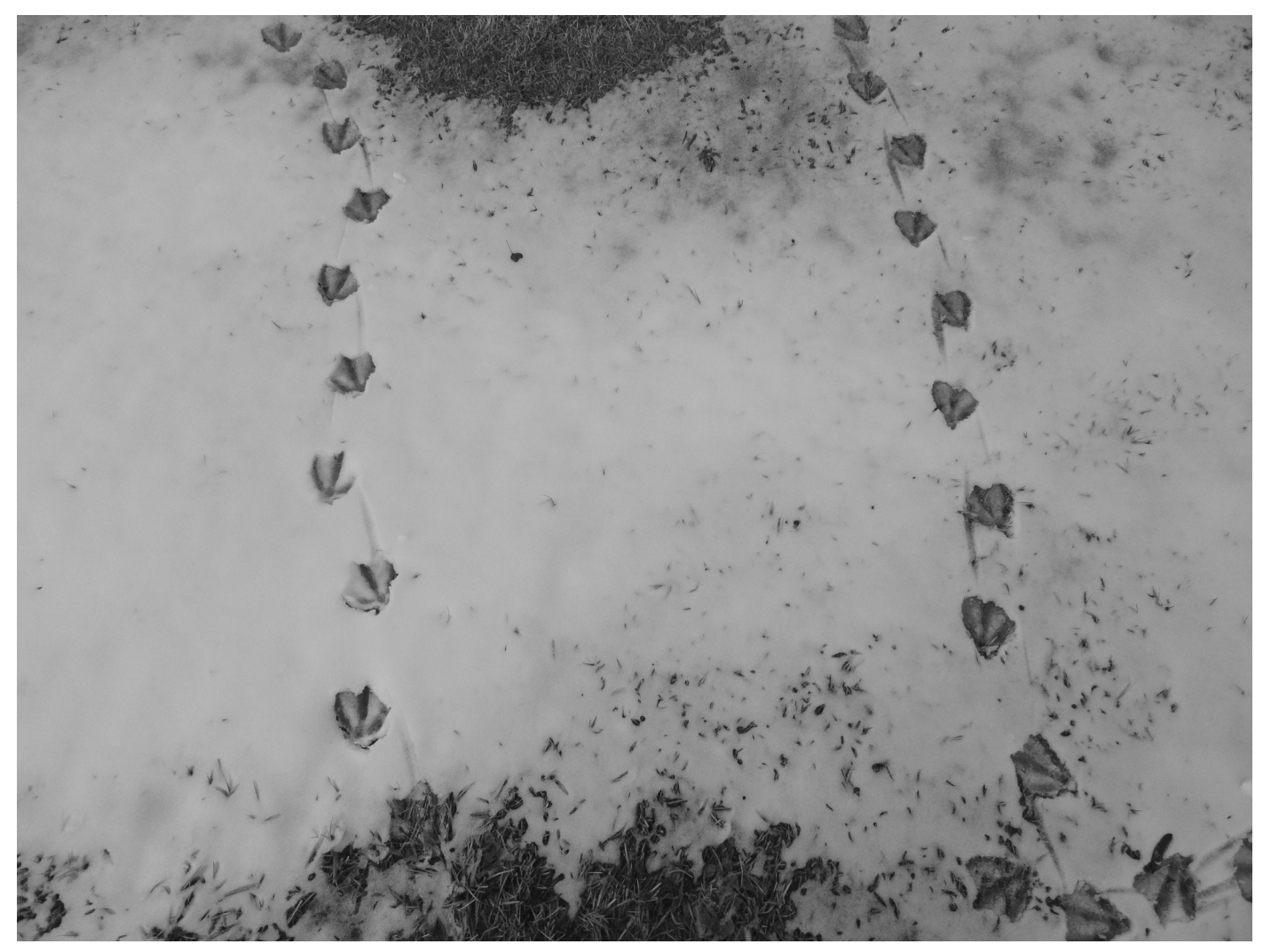
FIGURE 3. Canada Goose trackways in snow, University of Colorado Denver campus, January 12, 2012. Tracks are ~ 8 cm wide and steps are ~20-21 cm. Compare with Figs. 1-2.

The potential for livestock and wild animals to transfer biological agents on their feet is well known and has generated a huge agricultural and epidemiological literature, beyond the scope of this brief exposition. Hence the potential for transfer of biological matter on the feet of ancient tetrapods was presumably high also. However, the difficult question is whether such transfers can be recorded in the fossil record. Tetrapods have the potential to register tracks on firm substrates as they leave wet areas and travel onto dry ground. In such cases they may transfer mud, or other sediment and moisture, making tracks with little or no relief (as noted in the Tanzanian example cited above). The effects or impact of water, water with various chemical or biological ingredients (salts, algae, feces, etc.) or other liquids and solids, transferred by tetrapods to firm substrates is largely if not entirely unstudied, even in modern habitats (the study of microbe or disease agent transfer notwithstanding). Thus,