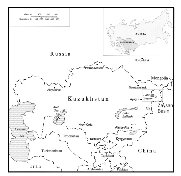
FIGURE 1. Map of Kazakstan showing location of Zaysan basin.

Furthermore, the base of each svita is supposed to correspond to the initiation of a separate cycle of deposition. Each svita thus has lithologic, biochronologic and genetic (sedimentologic) significance, so that the svita has no precise equivalent in Western stratigraphic theory and terminology. We have begun to publish a strict lithostratigraphic scheme of the Upper Cretaceous-Cenozoic strata in the Zaysan Basin