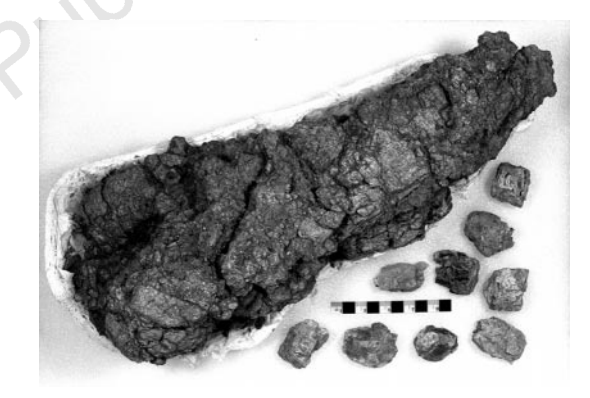
Figure 1 Large, bone-bearing theropod coprolite with some of the broken pieces that had eroded downslope. This specimen was found in Chamberry Coulee in the Frenchman River Valley, roughly 11.5 m below the Cretaceous/Tertiary boundary. Scale bar, 10 cm.

The tremendous size of the specimen indicates that the faecal mass was produced by a large theropod. The largest theropod found in the Frenchman Formation is Tyrannosaurus , with an estimated body weight of 5,400 to 6,300 kg (ref. 11). Although other theropods, crocodylomorphs, and a chelonian ( Dromaeosaurus, Saurornitholestes, Troodon, Richardoestesia, Chirostenotes, an ornithomimid, Leidyosuchus, Champsosaurus, and Aspideretes ) have also been recovered from the Frenchman Formation<sup>8</sup>, these smaller carnivorous taxa probably weighed <100 kg (ref. 12), and it