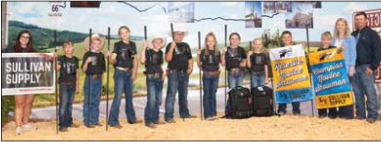
Top 10 Novice Showmen