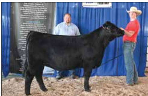
Grand Champion Limousin Female exhibited by Dawson Book