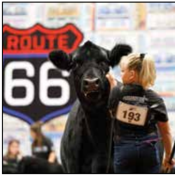
The Heartland congratulates all juniors on a successful junior nationals!