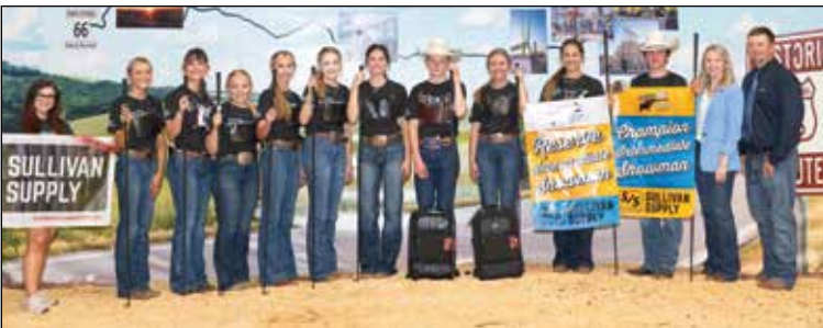
Top 10 Intermediate Showmen