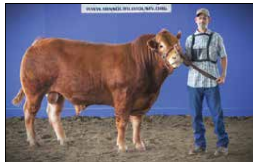
Grand Champion Bull exhibited by Cedar Creek Ranch

Cedar Creek Ranch of Thornfield, MO, showed the Grand Champion Bull, CCRA Kahlua 561K, a 5/28/22, polled, red, Fullblood son of Whinfallpark Lomu out of CCRA Creme De Menthe 561D.