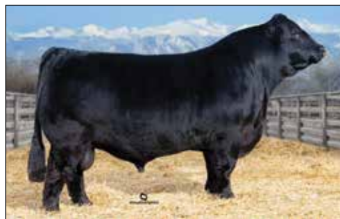
ELCX Kings Landing 599 D (sire of Lot 2)