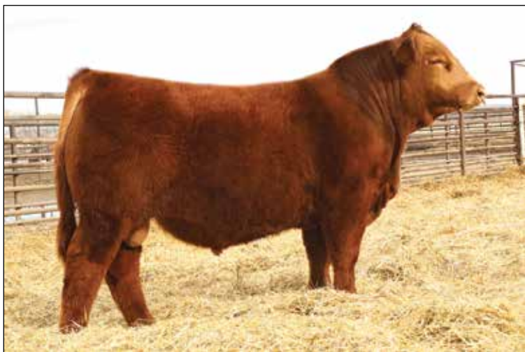
Wulfs Latigo K750L ET