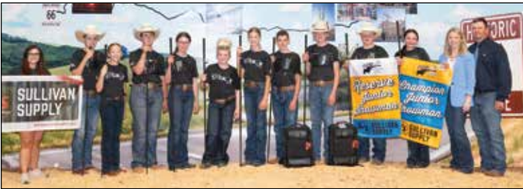
Top 10 Junior Showmen