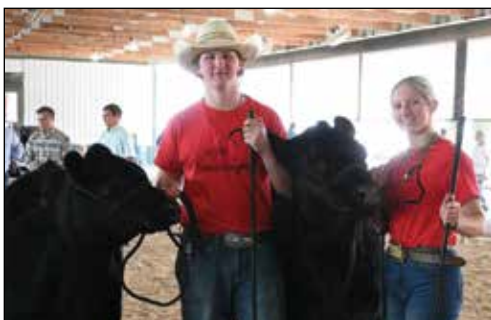
Champion Pair of Females shown by Dawson Book