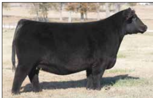
EXAR Princess 1637 (maternal sister to Lot 1)

Brian Falk of Harveyville, Kansas, purchased three sexed female embryos by TASF Crown Royal 960C out of LLJB Absolute Style 3056A. They will be 75% Lim-Flex, double black and homozygous polled.