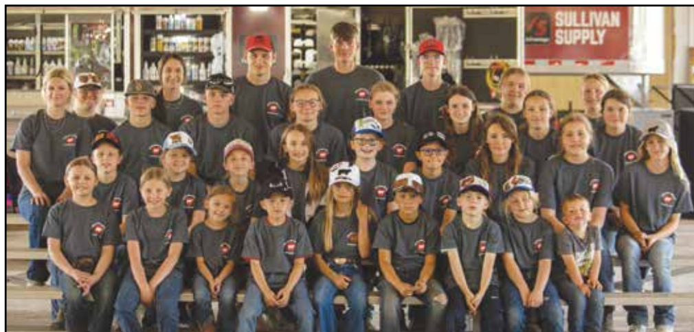
A great time was had by all at the Heartland Regional Junior Show in Iowa!