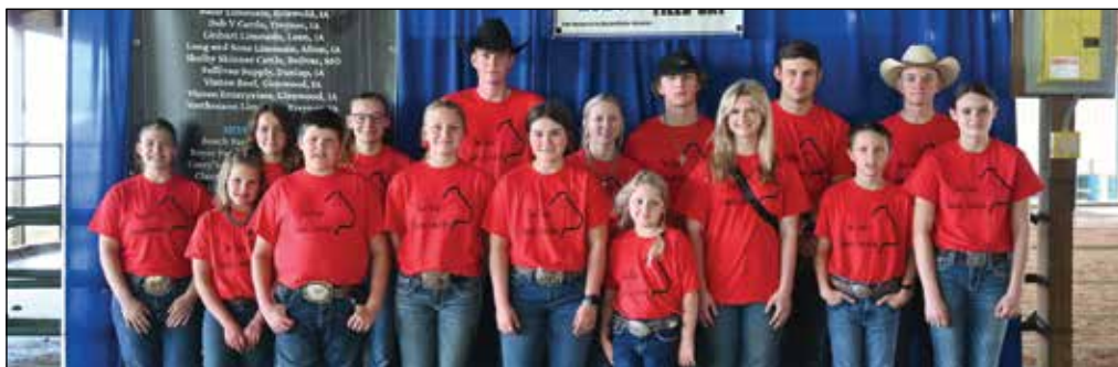
Iowa Junior Exhibitors