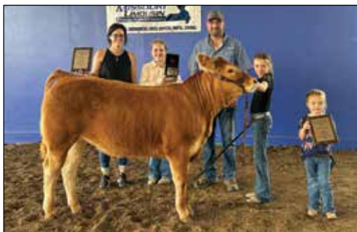
Grand Champion Female exhibited by Double R Limousin

GTMO Kiss Me Kate 082K as named Reserve Champion Female. She was a 6/1/22, double polled, red, Fullblood daughter of Tom out of CCRA Lady Deva 08D, shown by Cedar Creek Ranch of Thornfield, MO.