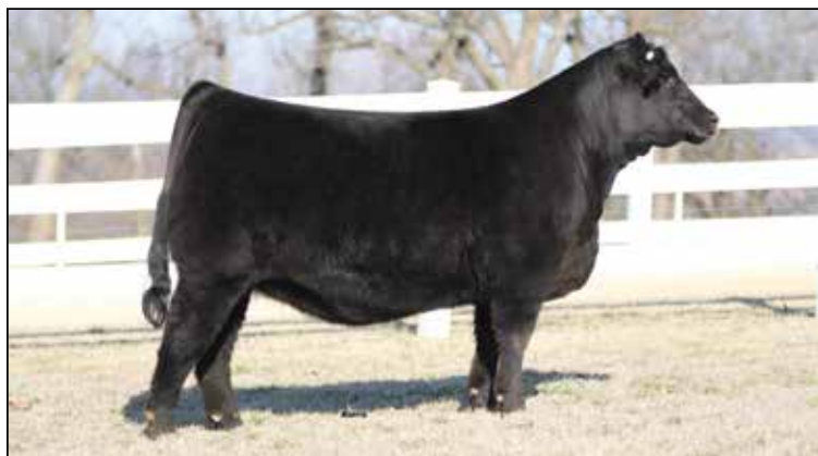
MINO Knows It All 242K ET

Sale Team: MC Marketing, R&R Marketing, Helton Consulting