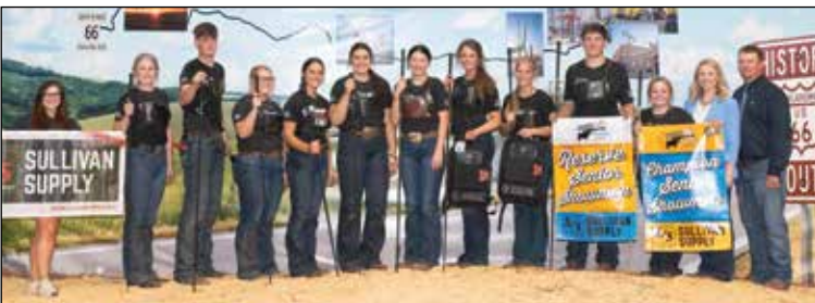
Top 10 Senior Showmen