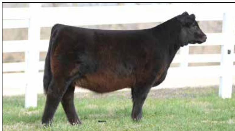
MINO Luck Be A Lady 239L ET