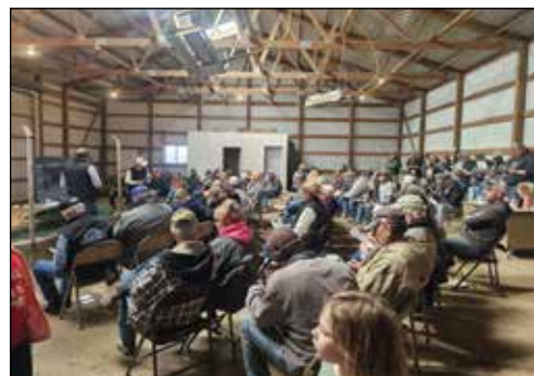
It was a full house of bidders and buyers for the live video auction.