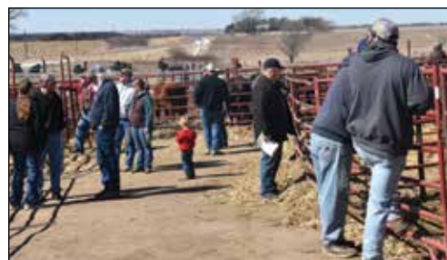
The pens were full of prospective buyers prior to the sale beginning.