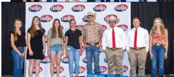
Cow Camp winners at Legends of the Mother Road!