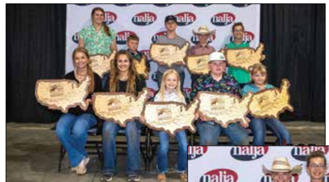
Sweepstakes winners at junior nationals in Tulsa, OK. Congrats to Minnesota on the state win!